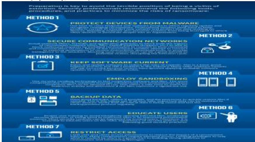
Figure 4: MacAfee Ransomware Best Practices (Labs, 2016)

Ransomware threats and attacks have been developing rapidly, and the more cutting-edge code is industrialized by cybercriminals to overcome any security measure in place. MacAfee who considered as one of the leading cybersecurity solution software developer and the provider has released an infographic conveying seven best practices in securing against ransomware threat (Lipovský, 2016).