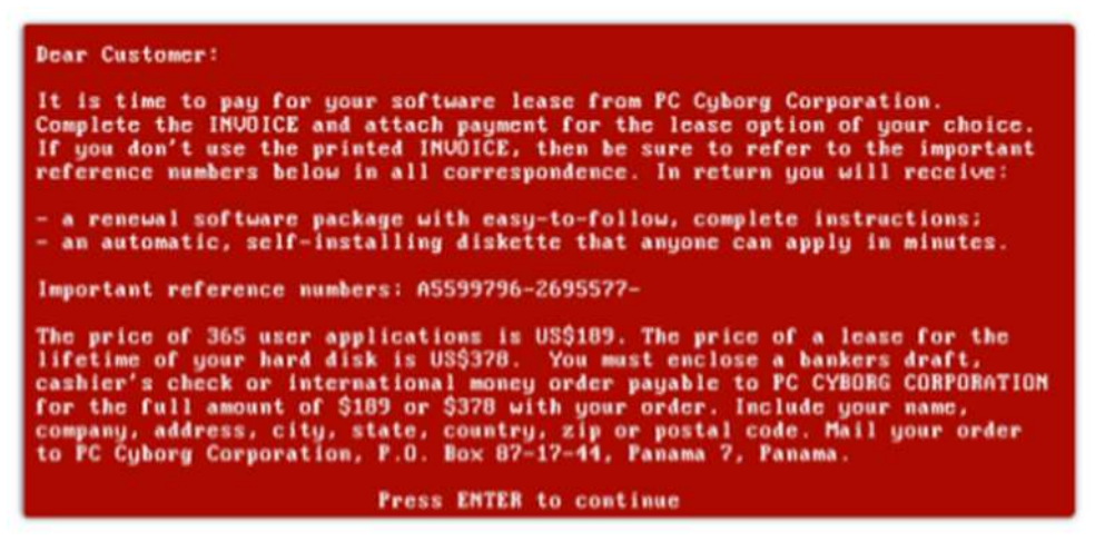
Figure 1: Illustration of screen lock of malware Aids (Networks, 2017)

According to Palo Alto Networks, Unit 42 report on Ransomware tiled "Ransomware: unlocking the lucrative criminal business model" (Labs, 2016). The first recorded incident of the malicious code ransomware was called the AIDS Trojan AKA (PC Cyborg) created by Dr. Joseph L. Popp, a biologist who had a devoted interest in aids medical research. Where he has distributed 20,000 floppy disk to delegates of fellow aids researchers, containing a malware that activates after 90 reboots, then displays a message instructing to pay a licenses fee of US$ 189 to an account post office box in Panama[1]. The tactic applied and the way it has been executed was considered unconventional for its time. Some might argue it was an evil genius plan if the intention was right. However even when Dr. Joseph was apprehended, prosecutors have had a tough time dealing with the case, as there were no laws introduced to combat such crimes related to technology at that time. Creating such malware as a first of its kind, and from someone who is from a biology background, the malware was coincided as weak, and flow was swiftly discovered. That enabled researchers to reverse the code and find a solution to unlock the encryption and retrieve data and gain access to the device.