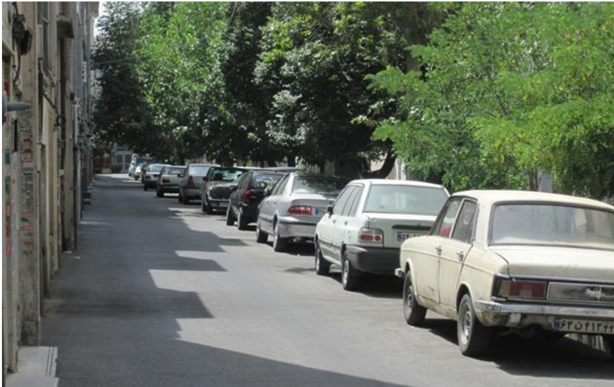
Photo 1. to change the streets social function to the function of traffic on Narmak neighborhood of Tehran

in neighborhood of Narmak is not used despite Bicycles home and its path. Lack of necessary conditions for the healthy practices such as walking can reduce social interaction and thus the spread of individualism in the neighborhood of Narmak. while our cities never been as such in the past. Iranian traditional urban tissue that represents the homogeneous spatial relations among individuals and physical appearance of the city was adapted to points the gathering and dialogue. The center of a neighborhood was physical-spatial field of social relations that naturally occurred.