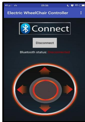
Figure 4. Graphic User Interface for mobile app

Figure 4 shows the Graphic User Interface for a smartphone application used to control the movement of a wheelchair. This is the second version of the development of this smartphone control application. The first version only allows regular movement in 4 directions, while for the second version there are improvements in terms of movement control by adding a control button in the middle where the user can freely control the joystick movement, compared to previous version where the direction only limited to 4 movements according to the direction of the arrow. Bluetooth connectivity needs to be done first, and the status of this connection will be visible on the application interface view. However, this is not the final version as there are still some related issues such as unstable connection and there are a few errors when the user moves the wheelchair.