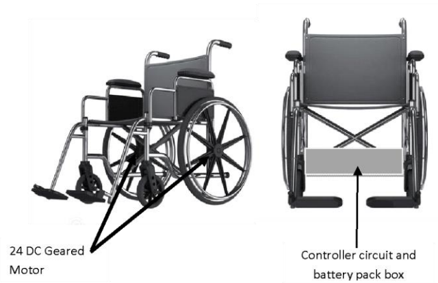
Figure 2. Model Design of Electric Wheelchair

By default, there are 4 main operations that can be controlled by this electric wheelchair user. The operations are as following: