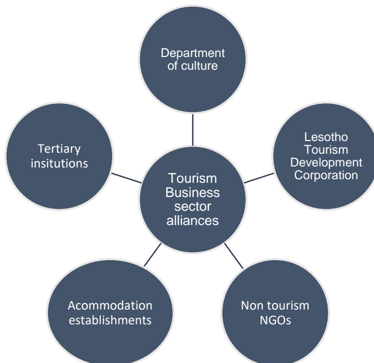
Figure 1: The dimensions of tourism businesses alliances

It appears that the private sector to government organisations alliances is not highly utilised in Lesotho as confirmed by both the private and public sector participants. Only three government organisations do collaborate with the private sector, yet they all seem to have weak linkages. For example, the tertiary education institution does work with accommodation establishments through student internships, Department of Civil Aviation through minor sponsorships, and LTDC through capacity building programmes offered to tourism businesses.