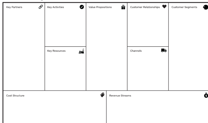
Figure 2: Business Model Canvas Framework