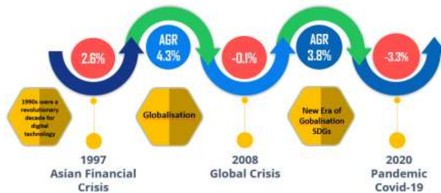
Figure 1: Global Business Cycle, 1990 - 2020