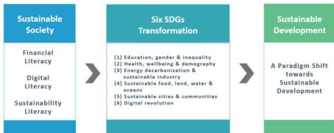
Figure 3: Intergrated Framework of Remodeling Economy towards Sustainable Development

Since the consequences of the Covid-19 pandemic remain highly uncertain at this point, realizing the role of these three key dimensions of literacy in the development model of respective countries, particularly those vulnerable societies and nations, should be the ultimate priority at national and global agenda. Thus, by intergrating the financial, digital and sustainability literacy with SDGs Transformation framework, it may lead to comprehensive and systematic prosess of remodeling economy towards sustainable development .