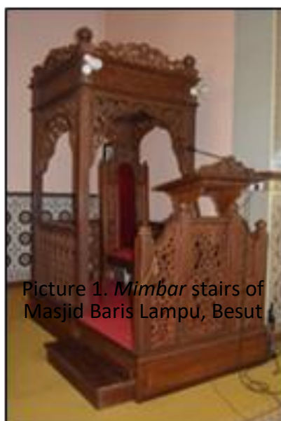
Picture 1. Mimbar stairs of Masjid Baris Lampu, Besut

It is observed that pulpit stairs in Terengganu mostly consists of 3 to 7 steps. However, each pulpit has a different number of steps according to the district where some of the pulpits have 1 (Picture 1), 2 or 4 steps (Picture 2). The number of steps built is found to be based on the design of the pulpit according to the size, material, area and width of the mosque.