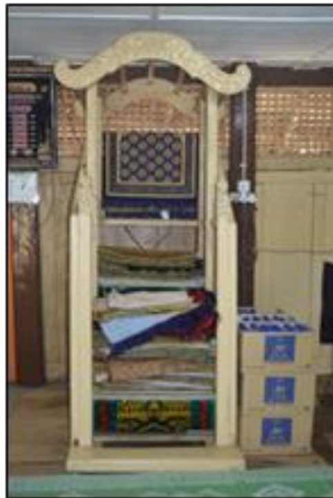
Picture 3. Pulpit of Old Mosque at Tuan Village, Kemaman

Pulpit stairs during Rasulullah's time is located at the front where when Rasulullah goes up the stairs, he will be facing away from the jemaah , but will face the jemaah when he delivers the khutbah. That way, all the jemaah present will be able to see Rasulullah's whole body clearly. However, most of the newer pulpits built around 2009-2014 being studied revealed that majority of the stairs are located at the right and not at the front such as at older mosques. The following is an example of the position of the old pulpit in Terengganu (Picture 3) showing that the stairs were in front of the pulpit as in the time of the Prophet.