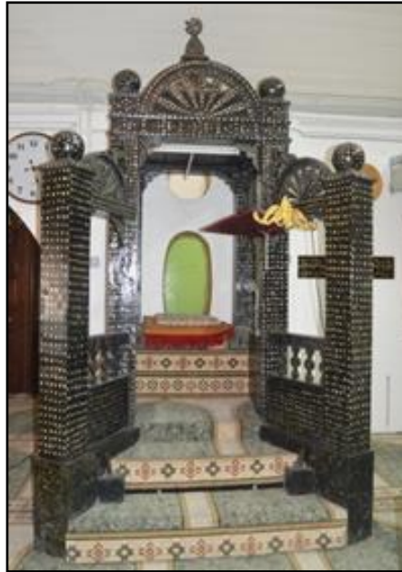
Picture 4. Pulpit of Al-Jamhuriyah Old Mosque, Kuala Besut.

and the smaller size of steps might have suited the imam at that time. Despite the width of the stairs is smaller, the distance between one step to another seems rather far (Picture 4).