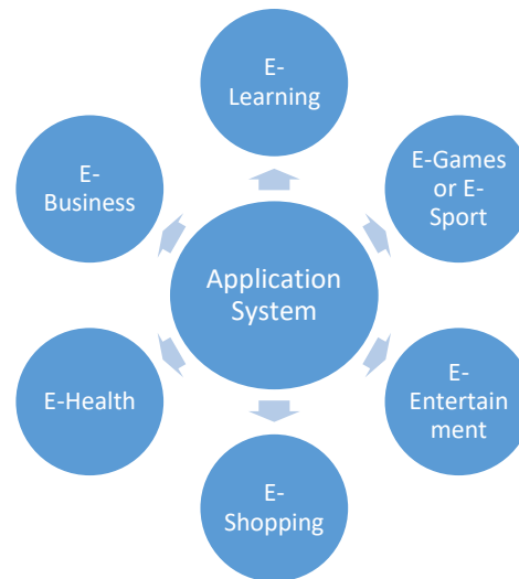
Figure 1: A proposed model of application system

Based on the review that has been done, the proposed model of application system with IR5.0 related to the Youth development activities is developed which can be categorized into several systems. The model and its application system is shown in Figure 1.