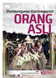
Figure 1.1: Pembangunan Kontemporari Orang Asli

This section focuses on the number of rhetorical modes found in the study sample that have been identified one by one based on Figure 1.1, Figure 1.2, and Figure 1.3. The parsing analysis technique is used to obtain the total number of rhetorical applications by the authors of the book as research data. The data obtained provides answer for the first objective of the study by reporting the distribution of the application of rhetorical modes specifically.