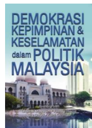
Figure 1.2: Demokrasi Kepimpinan & Keselamatan dalam Politik Malaysia

Based on the number of applications recorded, it is clear that the authors have chosen the expository rhetoric as a skill to build a storyline with their own style to present information to the readers of the scholarly book. It coincides with the view of Bakar (2015) that rhetoric is related to a person's proficiency in language, or according to Amir (2019), rhetoric needs to be applied by writers to produce an effective writing.