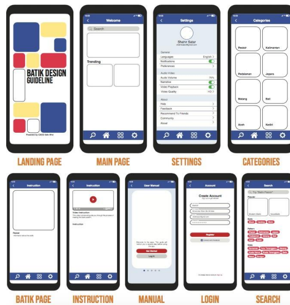
Figure 3: Comprehensive Design

The final phase for the design development of Batik's apps is the final design for the prototype (Figure 3). This stage involved inserting the detailed data needed for the apps to function, such as the image in the apps, inserting the button's name under the icon, and the information about the batik pattern.