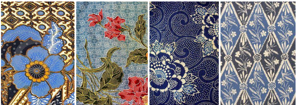
Figure 1: Example of Malaysian batik pattern

Two in-depth interviews were also conducted with the Graphic Designer. The purpose is mainly focused on the design aspects of the potential medium that can promote the Malaysian batik pattern. The main point of discussion is on the element of design, the color, typeface used, the layout, and discussing several features that could be used further. Both the designers provided insight into the interfaces of the potential media promoting and how each element should give smooth and clear user experiences.