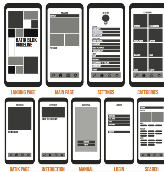
Figure 2: Rough interface layout

The interface layout is prepared roughly through black and white looks (Figure 2). In particular, at these stages, it is more on the button placement and setting pages.