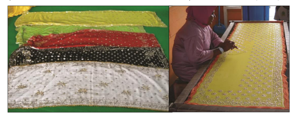
Figure 4 : Pictures taken from an article entitled "Makna Tudung Manto bagi orang Melayu Daik" by Febriyandi (2011).