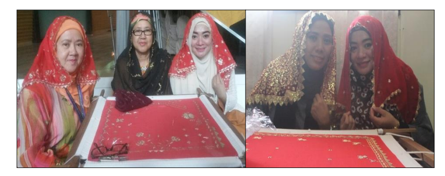
Figure 6 : The researcher with embroiderers who are still actively embroidering kelingkan.