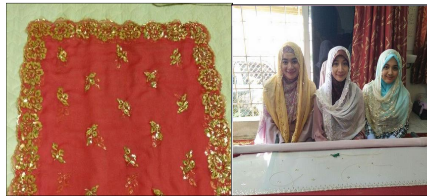
Figure 8 : Shawl from Kelantan and the researcher with an embroiderer who is still actively embroidering kelingkan .