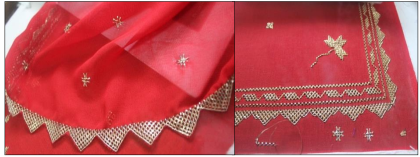
Figure 5 : Kelingkan embroidered shawl and selayah from Sarawak

Requests for kelingkan embroidery continue to this day although it is on a small scale. Orders for kelingkan shawls and selayah for weddings are most popular among Malaysians, although it is sold for a high price starting from RM1000 and above.