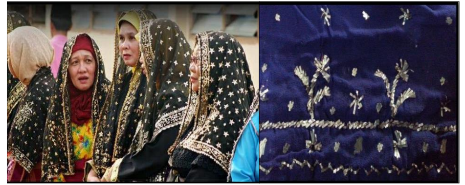
Figure 7 : Pictures taken from an article entitled "Selayah Keringkam dan Selayah Manto: Sulam Budaya Melayu Sarawak (Malaysia) dan Melayu Daik (Indonesia)" by Sarkawi & Abd. Rahman, (2014)