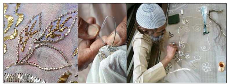
Figure 2 : Pictures of makaish or mukaish embroidery