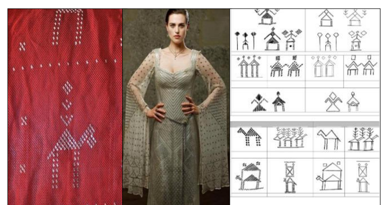
Figure 3 : Pictures of Tally taken from a journal entitled "Utilization of aesthetics value of tally woven fabric structures in fashion trends" by Elnashar et. al (2014).