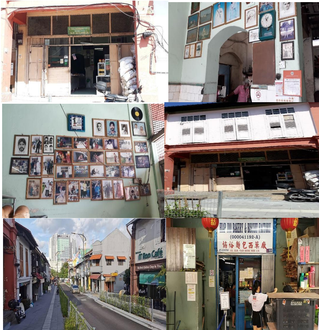
Figure 1: Street of Johor Bahru Old Town where Premise of Salahuddin Bakery is located