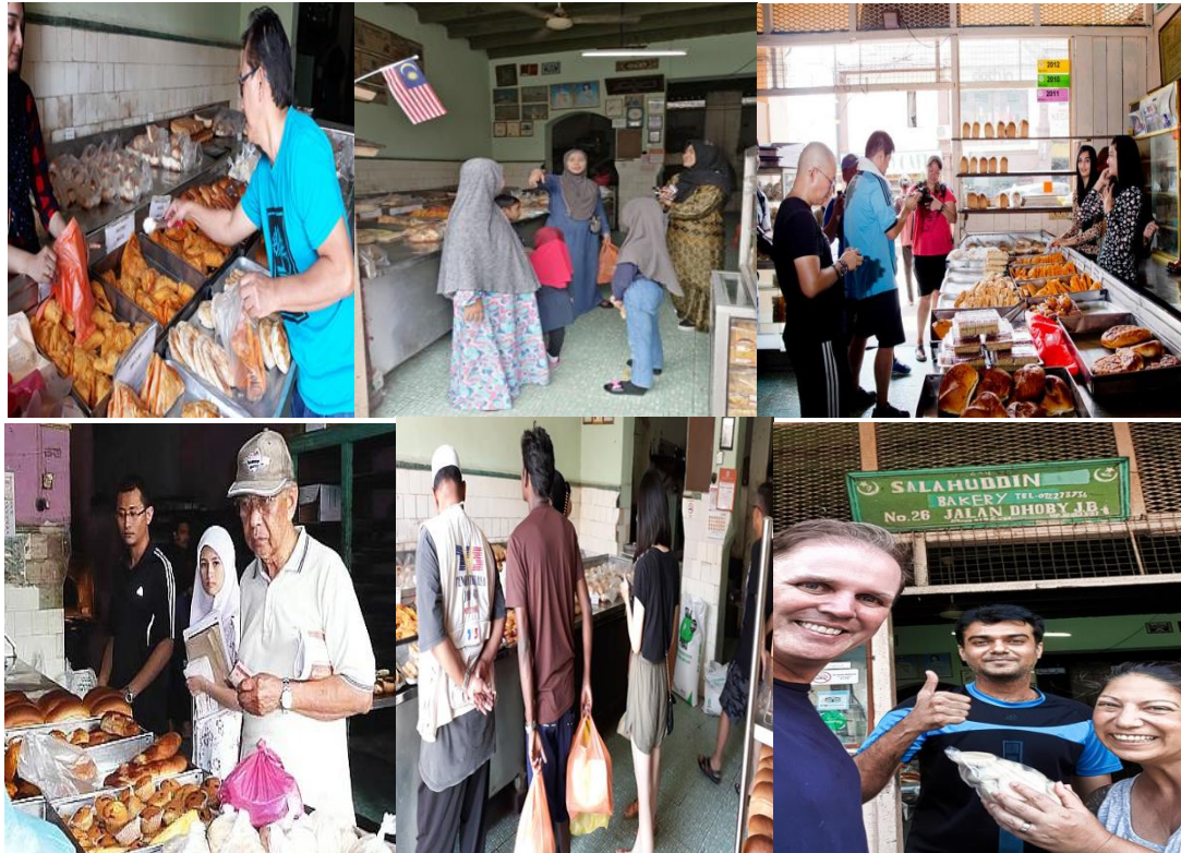
Figure 5. Some of the regular customers at Salahuddin Bakery.