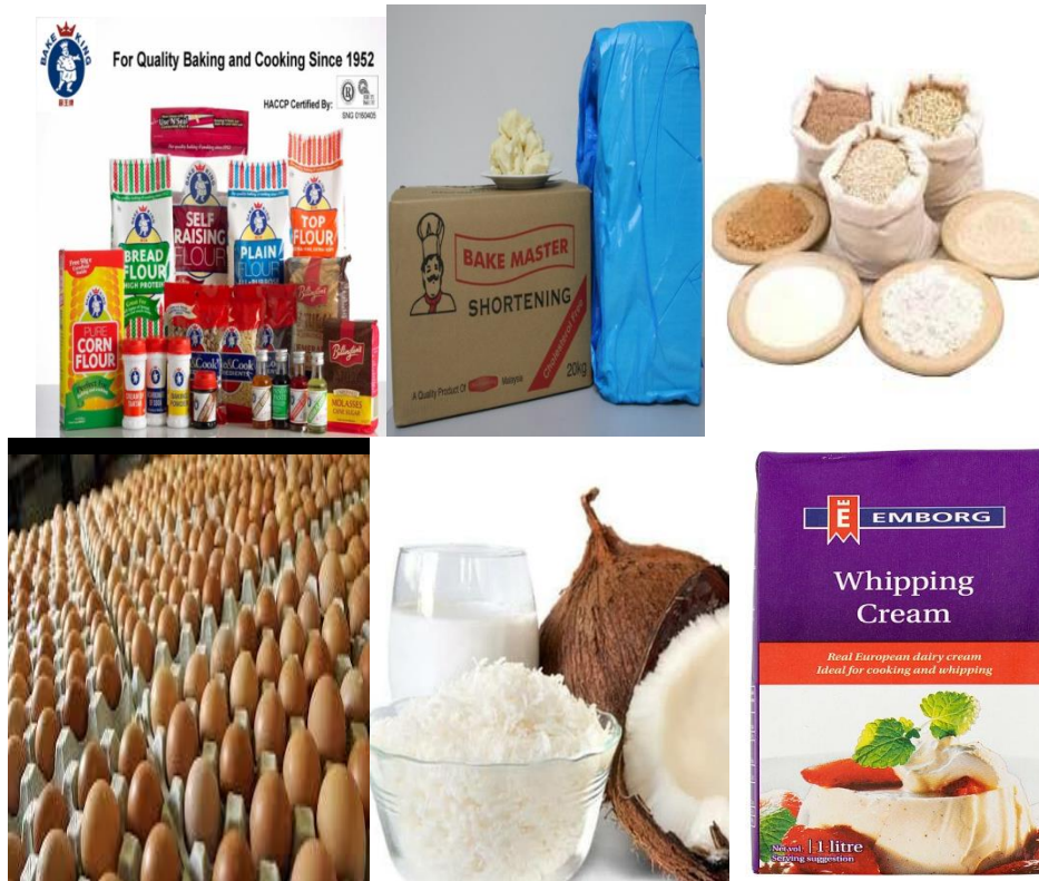
Figure 4. Types of raw materials used.