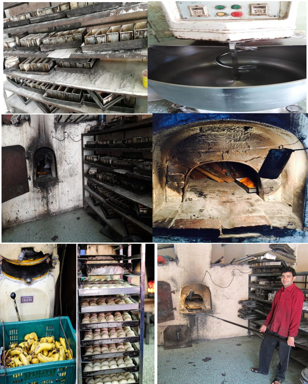
Figure 3. The main equipment used in the product preparation process.