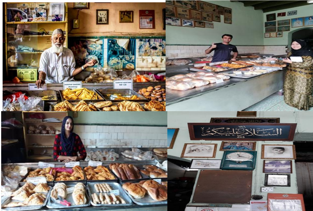
Figure 6. The owner takes turns with his son and daughter in managing the store.