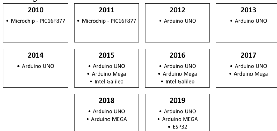
Figure 2: The type of microcontroller used in the course based on the course offered year

Based on the information obtained, the summary of the microcontroller according to the year is shown in Figure 2.