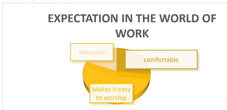
Figure 3: Expectation in the World of Work