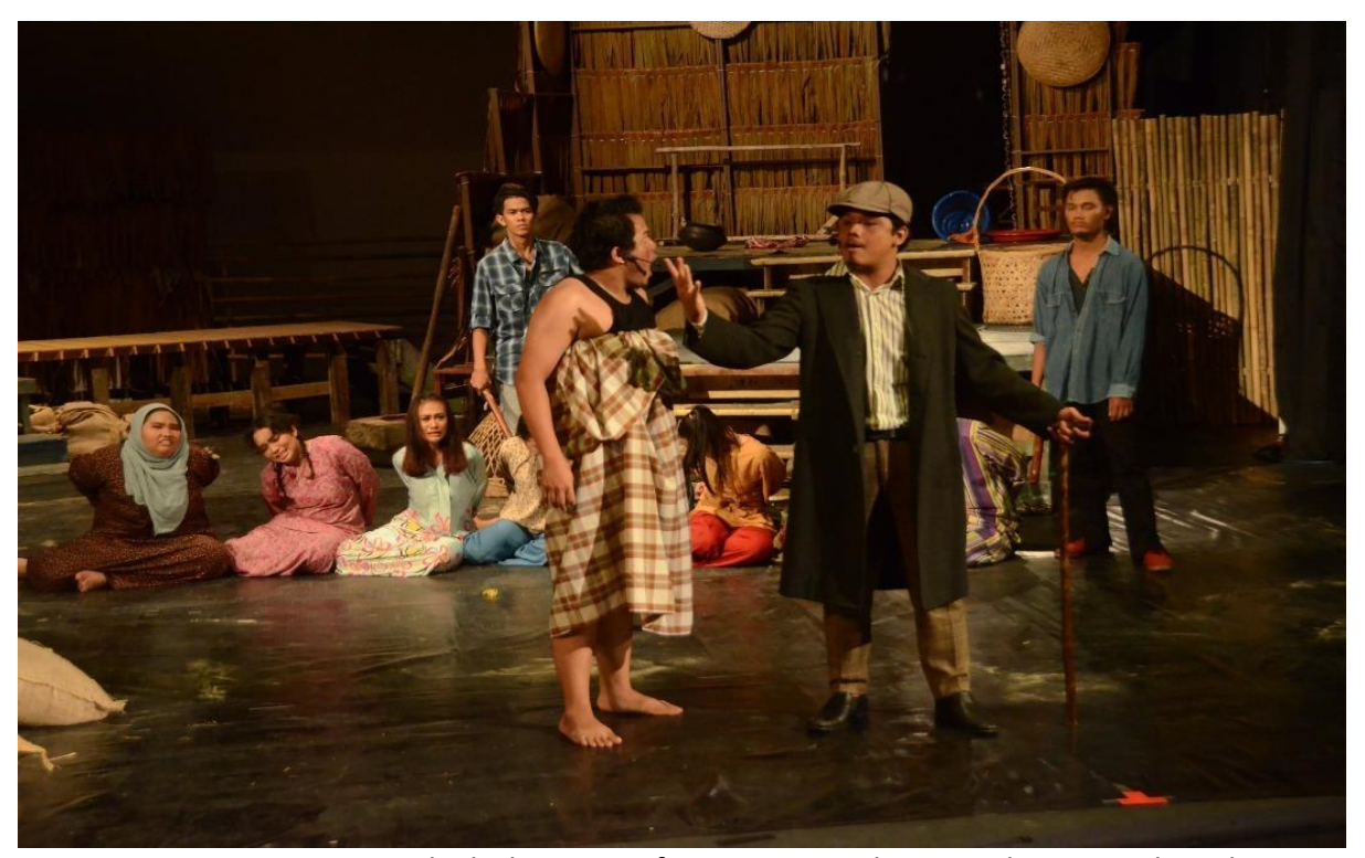
Figures 3 One scene in which the traits of superior social groups dominate the others in the Uda and Dara theatre performance

Vol. 11, No. 12, 2021, E-ISSN: 2222-6990 © 2021 HRMARS