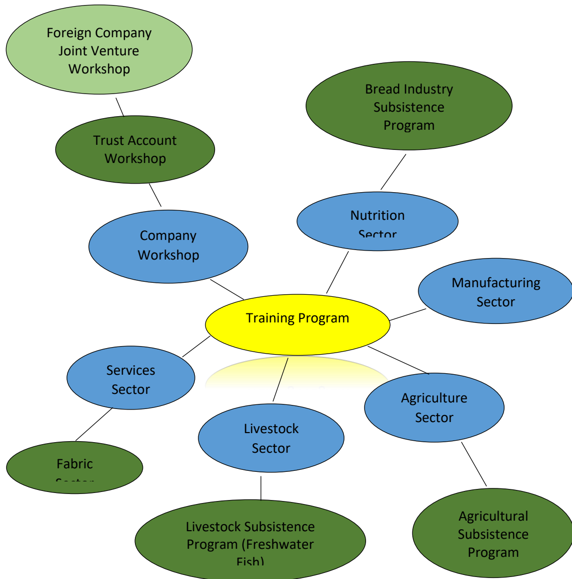
Table 2: Verbatim Data Themes from Mr A

considered employment. This means that the prisoners involved will be paid appropriate wages based on the type of workshop and work performed. Next, the researcher has summarized all the answers given by the informant, Mr A, as in the following diagram: