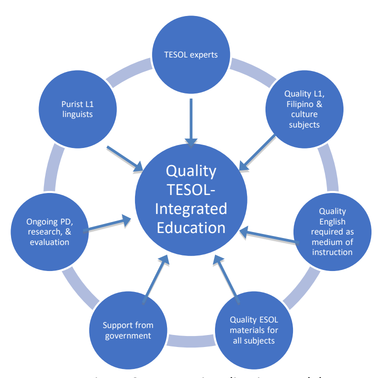
Figure 3: Internationalization Model

Vol. 3, No. 4, 2014, E-ISSN: 2226-6348 © 2014 HRMARS