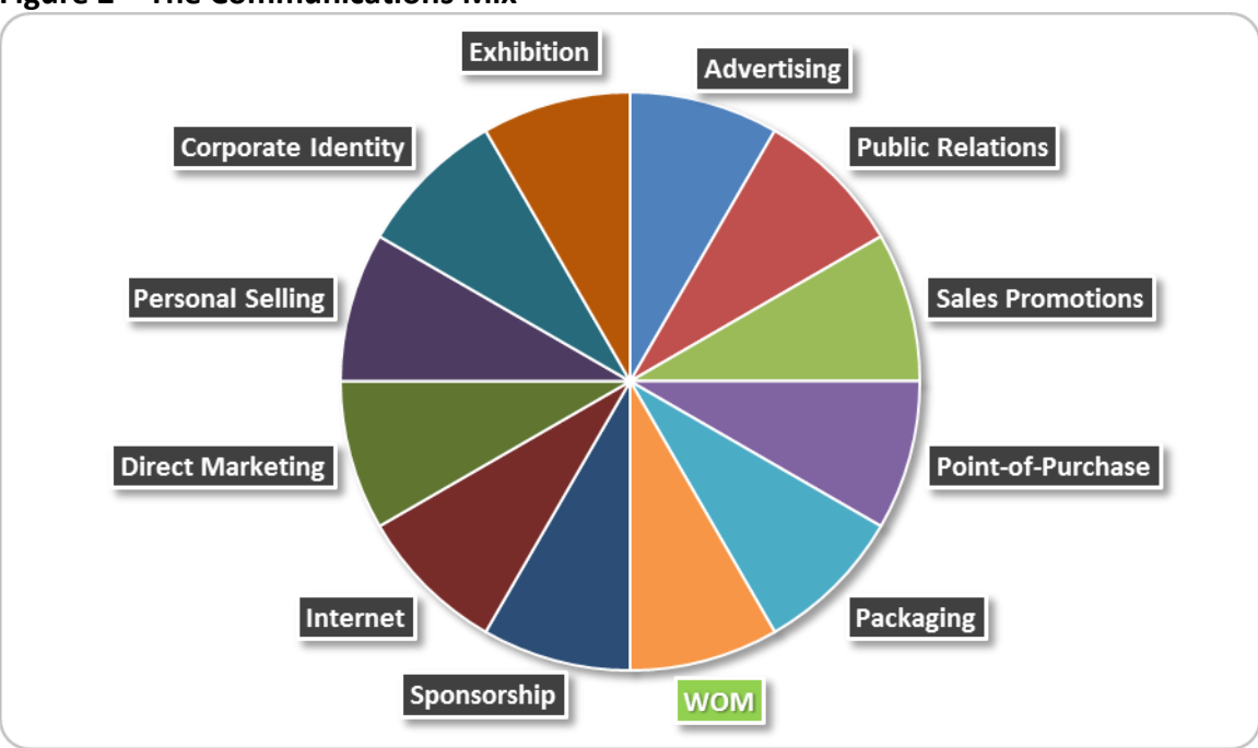
Figure 2 – The Communications Mix

identified by Smith and Pulford et al. (2009) are the same as the IMC tools identified by Belch and Belch.