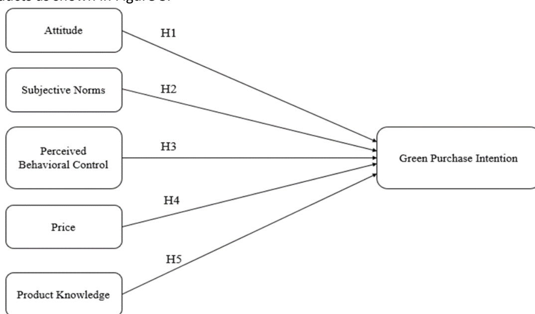
Figure 3: Research Framework

This study aims to measure the relationship between attitude, subjective norms, perceived behavioural control, price, product knowledge and consumers' willingness to buy green products as shown in Figure 3.