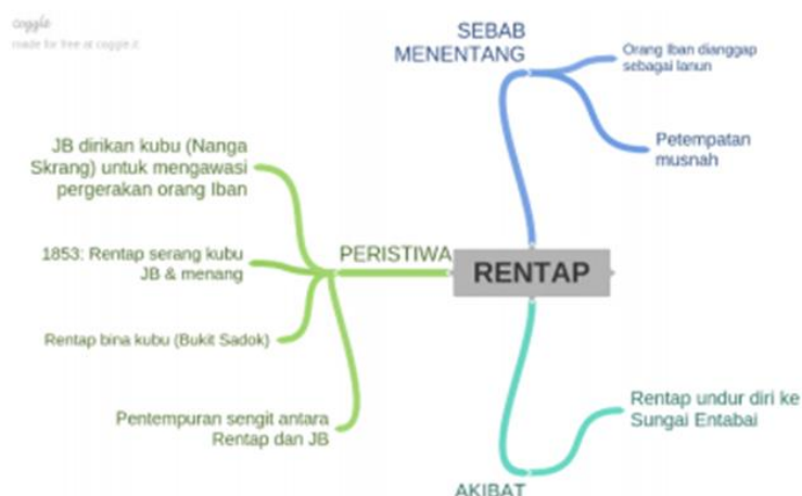
Diagram 3: A sample of mind map developed by a student using Coggle online application in which the student had synthesized and presented the historical facts in a meaningful way

The findings indicated that there was an increment in history knowledge before and after the GiT-C approach was implemented. As illustrated in Table 1, there was a 100% increment of students attaining grade A in history knowledge, indicating that the information process approach had helped students to analyze and synthesize historical facts and ultimately improved their history knowledge on topics of local warriors who fought against British Occupation that involved many names, dates and events that were too confusing to memorize in a chronological order.