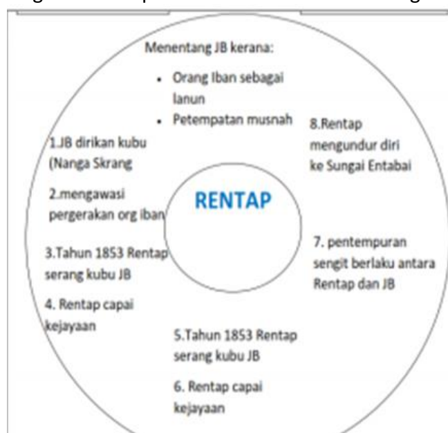
Diagram 2: A sample of circle mind map developed by a student using i-Think online application in which the students had extracted and analyzed relevant historical facts from their history textbooks

Upon the identification of relevant historical facts, the students extracted and analyzed the facts using a circle map available in i-Think online application. A sample of a circle mind map is shown in Diagram 2. The students further synthesized and presented the historical facts in a meaningful way using Coggle mind map online application. Diagram 3 illustrated a sample of a mind map developed by a group of students using Coggle. All presentation materials were kept and organized in Google drive which provide access to students to edit their work at their own convenience time and place. In the study, the ubiquitous learning occurred whenever the students used i-Think and Coggle online applications to complete their history presentation materials. The ubiquitous learning also took place whenever the students accessed, edited and organized the presentation materials in Google drive.