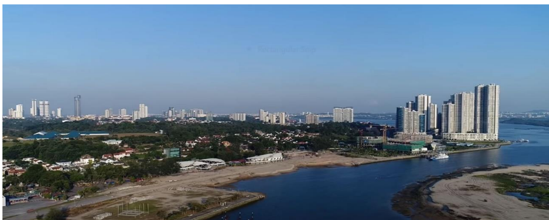
Figure 2: The reclamation project at Pantai Lido for development purposes.

"Only memories remain ... no more fishermen go fishing ... I also feel what other informants feel ...looking for crabs during the leisure time but... today crabs are difficult catch here... I am so angry about the development that is happening... why ruin the nostalgia of the locals here?"