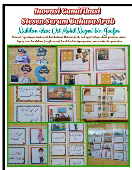
Figure 4: Gamification 4: Horror Station لعبة محطة الرعب.

This hands-on gamification is used for writing skills to achieve the learning standards 3.2.1, 3.2.2, 3.3.1, and 3.4.1 contained in the DSKP Arabic Year 4 of primary schools. Horror Station Gamification is complementary to the learning topics in this study because it involves the assessment of writing skills based on the content that has been learned over the four weeks. The following is the implementation procedure of the Horror Station gamification module.