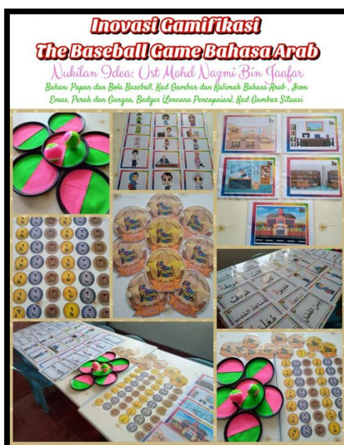
Figure 1: Gamification 1: The Baseball Game لعبة البيسبول.

This hands-on gamification is used for listening and speaking skills to achieve the learning standards 1.2.1, 1.2.2, 1.2.3, and 1.2.4 contained in the DSKP Arabic Year 4 of primary schools. This gamification involves eight mechanical elements, namely a points system, level/stages, challenges, leader board, storyline/rules, rewards, badges, and feedback. Emphasizes cognitive, psychomotor, and affective aspects and is implemented hands-on. Here is the procedure for implementing the gamification module of The Baseball Game.