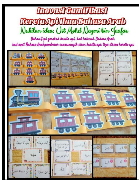
Figure 3: Gamification 3: The Train of Knowledge لعبة قطار المعرفة.

The fourth level of gamification: Each group is given dice and paper of various colours. For this fourth level, they have to build a dice that contains the words alif lam qomariah and alif lam syamsiah. Each group is free to determine whether the dice constructed contains the words alif lam qomariah or alif lam syamsiah. If students mix words in one dice it means they have not mastered learning. Scores are given for the most neatly constructed dice, completed quickly and sentences are written correctly. It is up to the teacher whether to give 20 or 25 marks. The teacher asks a student to roll the dice that have been built and in groups say the words on the wall of the dice. If the sentence is correct either alif lam qomariah or alif lam syamsiah without any mispronunciation, then 10 bonus marks are given to their group. This step is repeated for all other groups.