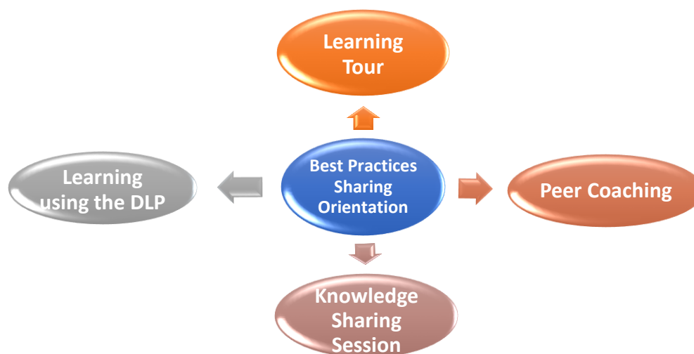
Figure 1: Collaborative Tools Through Best Practice Sharing Orientation

being the driving force for the change in teacher attributes. The four collaborative tools implemented are learning tours, peer coaching, learning using the Daily Lesson Plan (DLP) and knowledge sharing sessions of experienced teachers or expert teachers in their respective panels.