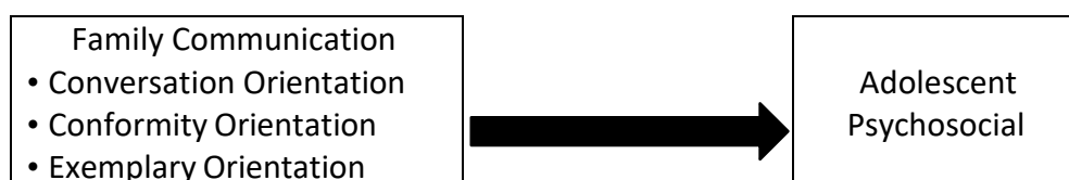
Figure 1 Conceptual Framework of the Study

Therefore, based on the literature review, a conceptual framework can be formulated to assess the impact of family communication factors on adolescent psychosocial. Three dimensions refer to family communication as in figure 1. Conversational orientation refers to the open attitude of parents to receive views from children, conformity orientation is the emphasis on children obeying and accepting what is suggested by parents (Mahmood & Mohammed, 2018) while exemplary orientation is an example of behaviour or good words portrayed by parents to connect children with creators and humans consisting of five methods namely Limited Speech, Smart Speech, Fun of Speech, Trusted Conversation and Alertness Question and Answer (Nawi & Jusoh, 2019)