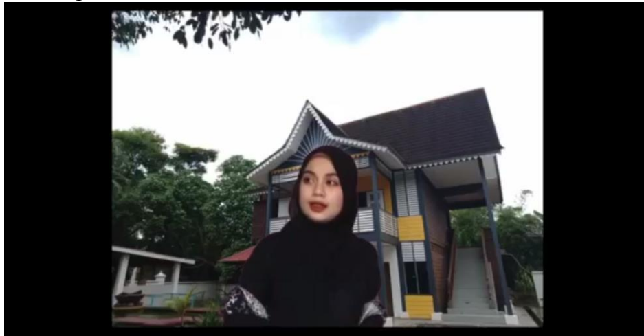
Figure 2: A student acting out a scene from the story of The Curse of Mahsuri.

Whereas according to Keris (1988), the style of literary language also not only conveys ideas and information, but the presentation of ideas and information evokes a sense of emotion, in addition to stimulating the mind and intellect of the reader.