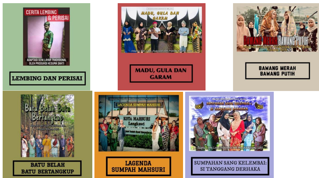
Figure 3: Posters of adaptations of the folklore and fables showcased.

'Adaptation of traditional screen art' imposes to bring an impact to the society with the understanding of concepts as well as the value of the myriad traditional folk literature within the country. By showcasing this online theatre, fresh new ideas are bursting and bubbling in the minds of these students as initiatives in ensuring the interests and assets of the Malay literature in Malaysia is up for further developments by upcoming generations. Example: