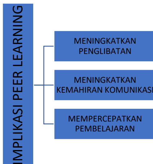
Figure 2: Framework of Peer

The SLR study conducted was also used to develop a conceptual framework based on the implications of peer learning. Figure 2 shows the conceptual framework that has been developed through the results of the analysis of the SLR study conducted.