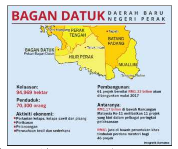
Figure 1: History of Bagan Datuk

Vol. 11, No. 4, 2022, E-ISSN: 2226-3624 © 2022