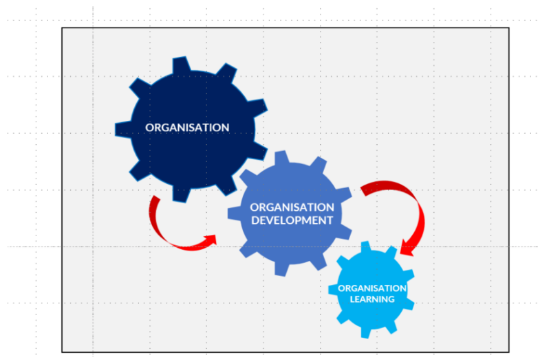
Figure 1. The relationship between organisational learning and development, as illustrated by authors in the literature review