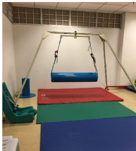
Figure 4 : Their physical education room