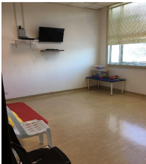
Figure 3 : The consultation room at the centre. room