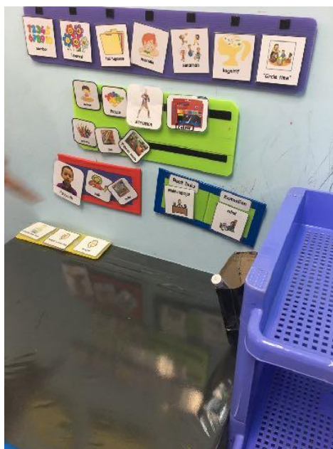
Figure 1 : The learner's study space.

usually do not prefer to share. One of the other main reasons is because due to the fact that their differences in abilities that make it crucial for them to have a distinctive learning objectives depending on their progress and development. These children are mostly visual learners and they tend to learn better through pictures and images. Padmadewi (2017) concurs with this notion as stating that visual or media supports do help in making them to focus more on the messages educators intend to convey. These children do listen to instructions. However, a proper introduction is very much needed when it comes to introducing them to new things or something that is to be considered as strangers. Educators or operational therapists usually make use of social stories as part of the lessons.