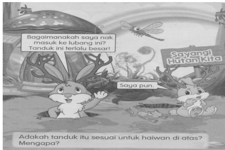
Figure 2: Storytelling Techniques

teaching and learning, it is able to make students enjoy learning and facilitate comprehension. For example, in teaching and learning to identify the basic concepts of science, storytelling techniques are used. The use of storytelling techniques improves students' recall of what they have heard from the teacher. For the area of "remembering", the technique of pictorial storytelling is presented by the author of the science textbook as follows