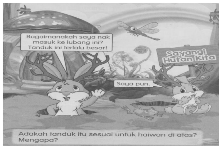
Figure 2: Storytelling Techniques

teaching and learning, it is able to make students enjoy learning and facilitate comprehension. For example, in teaching and learning to identify the basic concepts of science, storytelling techniques are used. The use of storytelling techniques improves students' recall of what they have heard from the teacher. For the area of "remembering", the technique of pictorial storytelling is presented by the author of the science textbook as follows