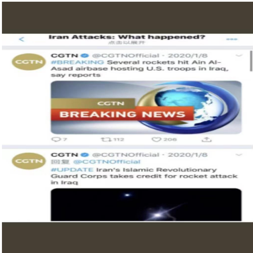
Figure 1.2 The moment CGTN posted on Twitter about Iran's attack on the Iraqi air base

The "moment" section is different from tweets. The information distributed by tweets is scattered, while the "moment" section is concentrated and convenient, so users don't need to flip through them one by one. CGTN is actually a gathering place for comprehensive news.