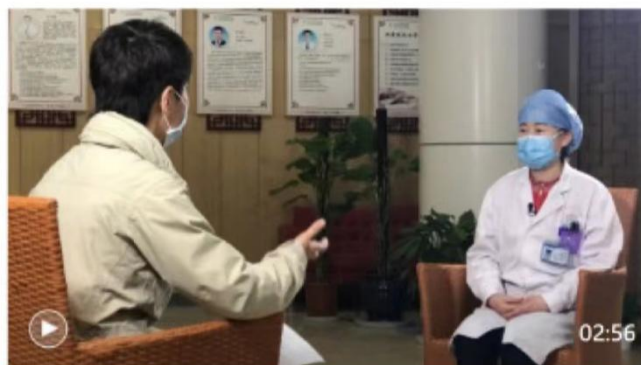
Figure 1.3 Videos in CGTN official website (There are many similar videos)