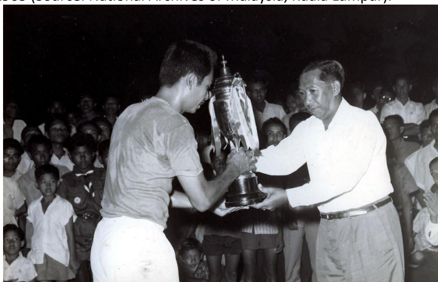
Picture 11: YAB Tan Sri Dato' Ibrahim Fikri bin Mohamad presenting the trophy to the Football Team Leader who became the Sports Champion in conjunction with Malaysia Day in 1963.