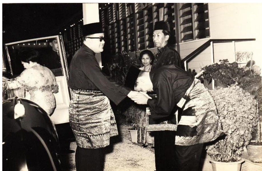
Picture 7: DYMM Sultan Yahya Petra Ibni Almarhum Sultan Ibrahim, Sultan of Kelantan departing from the Resort, Terengganu Chief Minister's Official Residence in Batu Buruk, Kuala Terengganu (Source: National Archives of Malaysia, Kuala Lumpur).