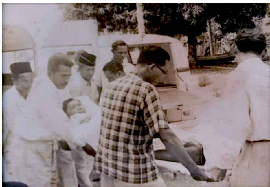
Picture 13: Photo of the incident at Batu 123, Kampung Awah, Jalan Kuantan-Temerloh, Pahang on 26 September 1973 (Source: Dato' Haji Mohd Nasir bin Ibrahim- son).