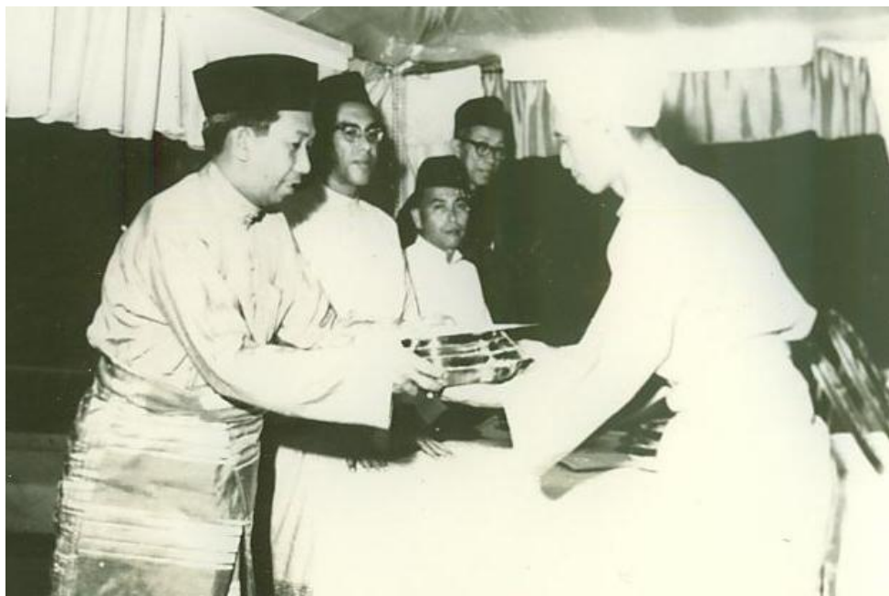
Picture 12: YAB Tan Sri Dato' Ibrahim Fikri bin Mohamad presenting a gift to Johan Qari at Terengganu State Level in 1965 (Source: National Archives of Malaysia, Kuala Lumpur).