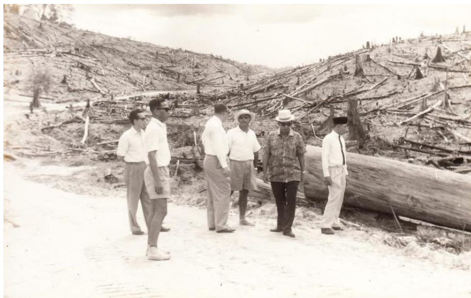
Picture 3: Working visit to an oil palm plantation in Sungai Tong, Setiu, Terengganu (Source: National Archives of Malaysia, Kuala Lumpur).