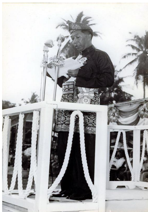
Picture 10: YAB Tan Sri Dato' Ibrahim Fikri bin Mohamad delivering a welcoming speech in conjunction with the celebration of Malaysia Day and the laying of the Foundation Stone of the Sultan Ismail Nasiruddin Shah Stadium at Padang Paya Bunga, Kuala Terengganu on 17 September 1963 (Source: National Archives of Malaysia, Kuala Lumpur).