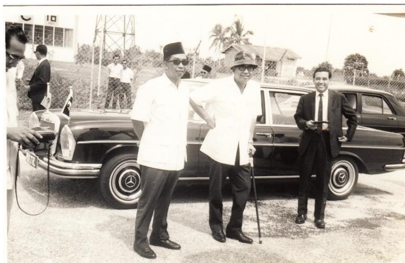
Picture 9: YAB Tan Sri Dato' Ibrahim Fikri bin Mohamad with the Second Prime Minister, Tun Razak bin Hussein (Source: National Archives of Malaysia, Kuala Lumpur).