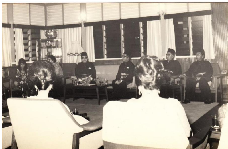
Picture 4: YAB Tan Sri Dato' Ibrahim Fikri bin Mohamad (right) in an official ceremony with His Majesty the Sultan of Terengganu and His Majesty the Sultan of Kelantan (Source: National Archives of Malaysia, Kuala Lumpur).