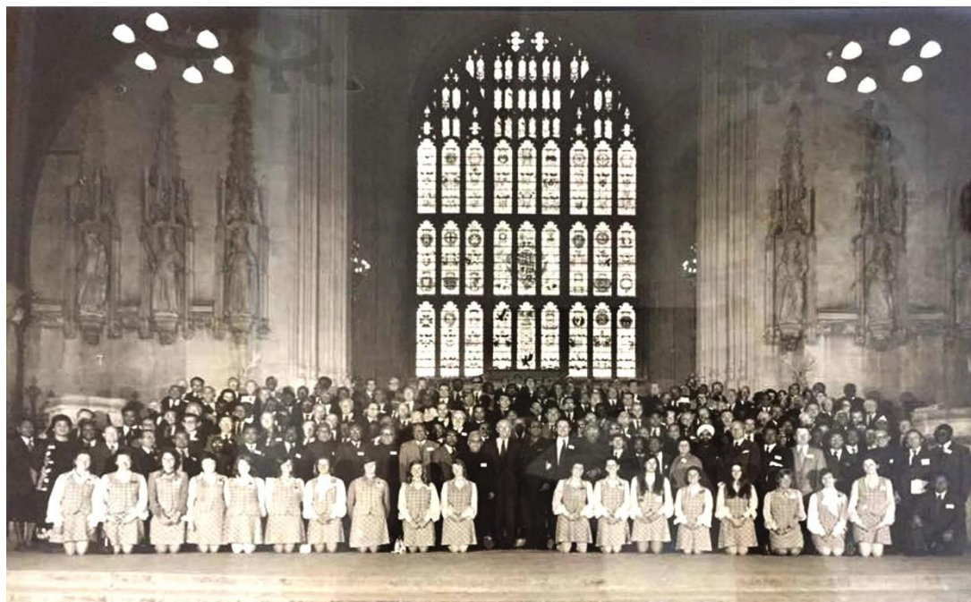
Picture 6: YAB Tan Sri Dato' Ibrahim Fikri bin Mohamad attending the Commonwealth Conference in England in 1973 (Source: National Archives of Malaysia, Kuala Lumpur).