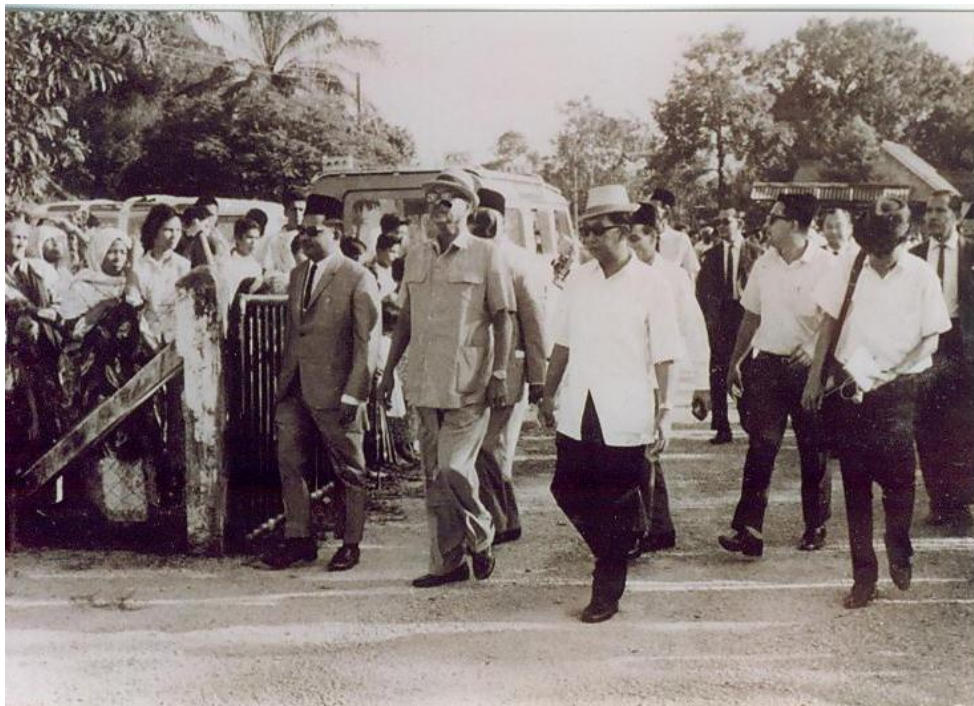
Picture 8: YAB Tan Sri Dato' Ibrahim Fikri bin Mohamad accompanying the First Prime Minister of Malaysia, Tunku Abdul Rahman Putra Al-Haj (Source: National Archives of Malaysia, Kuala Lumpur).