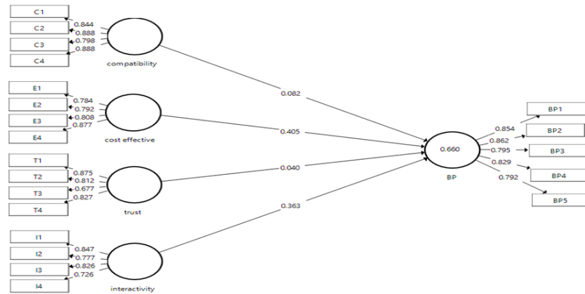
Figure 2.0: Reflective AMESurement model by Smart PLS Note: C = compatibility, E = cost-effective, T=trust, I=interactive

In the analysis of the reliability of the proposed model, the R^2 obtained is 0.660 (BP). In terms of reliability, R^2 can AMESure variance, which is described in each endogenous construction (Shmueli and Koppius, 2011). R^2 is also referred to as the predictive power in the sample (Henseler et al., 2009; Hair et al., 2011). Thus based on the R-squared of this study, it was found to be large, as shown in table 3.0 below