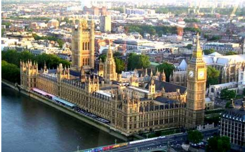
Photo 1: Example of correct model of compact city that residential blocks of three and four-storey of city streets on both sides to create a continuous appearance.

The main emphasis in the idea of the city compact is urban development on a Short building with average density. Consistent with this notion is not including single villa or apartment houses but mainly it what is in this idea as a pattern, examples of European cities that are put building maximum 5-4 classes on both sides the street. Then height of more than this value is keeps away us the from the idea of the compact city.