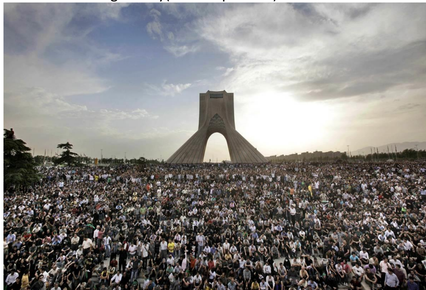
Photo 4: Azadi Square reminiscent of gatherings and various events

In the beginning should be do extensive studies on the development of cities and urban areas order to determine what city or urban area (For example, in metropolitan Tehran) are more successful than others in terms of sustainability criteria. Whether successful urban area there are in terms of stability? Do can be found successful cities in the iran country ? Through these