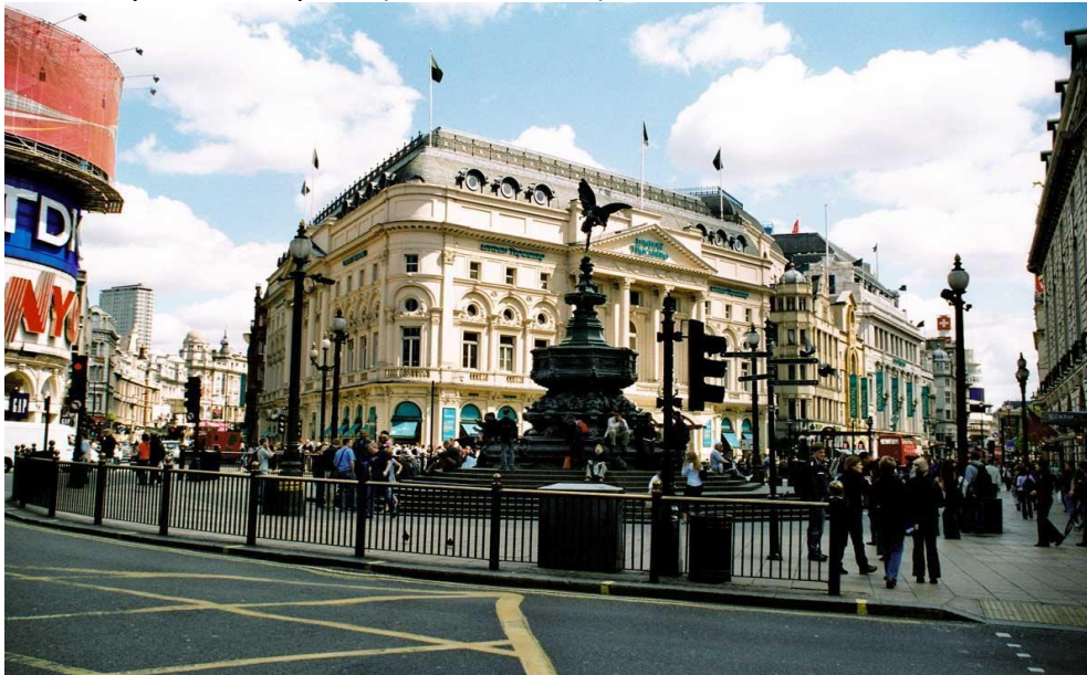
Photo 3: use mixing in compact city increase social interactions and livability in town.

Mix use in compact city strengthen its social dimension. Population density in 5-4 floors high is reasonable and socially allows a family can interact with the surrounding environment and from window monitored their children in the backyard or front playing . In idea of the compact city people can be more presence in urban spaces and streets with the creation of mixed uses and the expansion of pedestrian and public transport and increases communications and meetings. Create mixed uses and access through the equipped implementation axes for citizens attempts to raise positive social interactions and meeting face to face of citizens and seeks by defining some of the commercial, administrative, service, entertainment and more In central nodes to increase the vitality In urban spaces(masnavi, 2003).