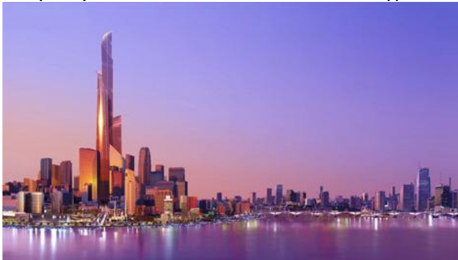
Photo 2: A sample of modeling incorrect compact city with a very high density.

in main axes of the city, in the ground floors of these buildings are usually utilities and commercial establishment. Then basis of planning in the city is mixed use that easy access and the need to travel long distances reduce by personal vehicle. Parts of city built along the street of the city make walls, as can be seen continuous views of a height of 5-4 floors. Integated transport system one of important factors is in the idea of the compact city that linked as