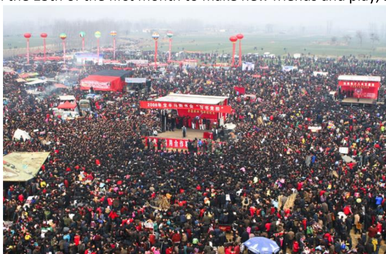
Figure 3: Majie Temple Fair about folk Storytelling art

The Majie Temple Fair, a national trade fair for folk storytelling and singing art (Figure 3), is held in the fields of Ma Street in Yangzhuang, Baofeng, Henan Province. Traditional folk performers from throughout the country perform. The Majie Temple Fair, one of the first Han Chinese folk art events on the national ICH list, has a 700-year history. Many folk artists perform here on the 13th of the first month to make new friends and play, sing, and dance.