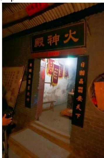
Figure 5: Temple of Fire

Every year, on the 7th day of the first lunar month, the Majie Temple Fair starts with the worship of the Fire God (Figure 5), one of the gods of folk beliefs in Chinese mythology, as noted by Yu Cong in his study of opera vocal repertoire: Historically, the most common time for folk art activities was during "social fire" activities during New Year's festivals. Some people with skills earn a livelihood through their art during times of agricultural leisure or poor harvests. Walking from village to village, one person can 唱门子- chang mengzi - which means standing at the door and singing , singing some auspicious words and small stories, while two people can form a 档子- dang zi -which means partner , talking, singing, and dancing to perform some small shows(Yu, 1992). Folk art developed from rural "social fires" and the skills of artists who made a living. According to Ma Zhifei, artists attend the Majie Temple Fair for folk storytelling art to perfect their abilities and revere ancient religions(Ma, 2014). Taoism adopted primitive fire deity worship.