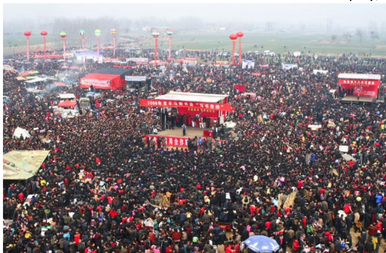
Figure 3: Majie Temple Fair about folk Storytelling art

The Majie Temple Fair, a national trade fair for folk storytelling and singing art (Figure 3), is held in the fields of Ma Street in Yangzhuang, Baofeng, Henan Province. Traditional folk performers from throughout the country perform. The Majie Temple Fair, one of the first Han Chinese folk art events on the national ICH list, has a 700-year history. Many folk artists perform here on the 13th of the first month to make new friends and play, sing, and dance.