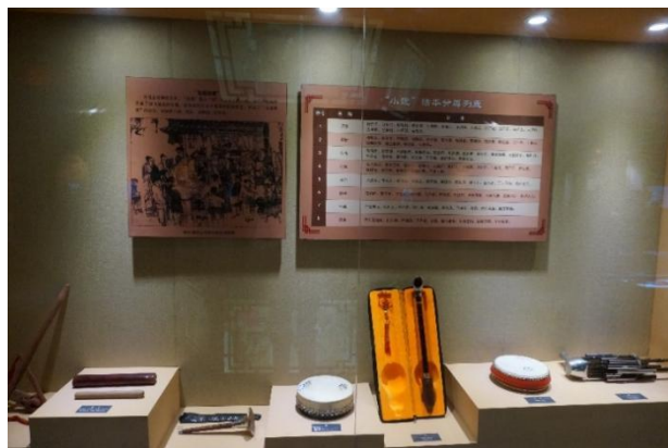
Figure 7: The Chinese Storytelling and singing Exhibition Hall Some of the instruments on display