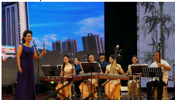
Figure 1: Henan Zhuizi performers and backing band

preserving, and rescuing to protecting and passing on a legacy. The State Council of China's 2005 "Opinions on Strengthening the Protection of China's ICH" established national, provincial, local, and county ICH lists. In 2006, China released 518 national ICH, including the Henan Zhuizi, one of the first preservation efforts. The performer holds a simple board in his/her left hand and sings in Henan dialect, backed by a Zhuizi String, guzheng, erhu, yangqin, sanshin, and pipa etc (figure 1). As a form of folk art that combines music and literature, it has a rich cultural connotation. This form of performance art's distinct artistic appeal has spread to numerous provinces and cities in China. The lyrics of Henan Zhuizi are straightforward to understand, while the plot of the performance is intricate.