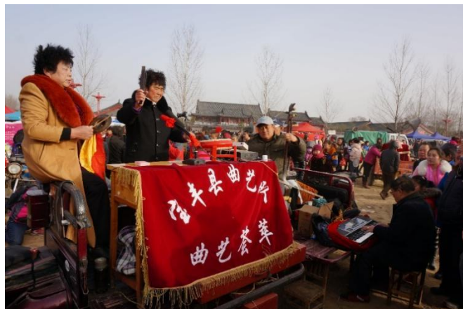
Figure 4: artists and their bands set up their stalls

On the 13th day of the first month, artists and bands set up their stalls (Figure 4) to sing folk tunes at the Majie Temple Fair. Majie Temple Fair organizers call the highest-priced artist the "Storytelling Master" to encourage him to attend and sell his performances. It is also the highest honor in the world of Chinese folk art.