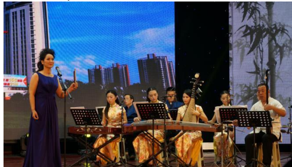
Figure 1: Henan Zhuizi performers and backing band

preserving, and rescuing to protecting and passing on a legacy. The State Council of China's 2005 "Opinions on Strengthening the Protection of China's ICH" established national, provincial, local, and county ICH lists. In 2006, China released 518 national ICH, including the Henan Zhuizi, one of the first preservation efforts. The performer holds a simple board in his/her left hand and sings in Henan dialect, backed by a Zhuizi String, guzheng, erhu, yangqin, sanshin, and pipa etc (figure 1). As a form of folk art that combines music and literature, it has a rich cultural connotation. This form of performance art's distinct artistic appeal has spread to numerous provinces and cities in China. The lyrics of Henan Zhuizi are straightforward to understand, while the plot of the performance is intricate.