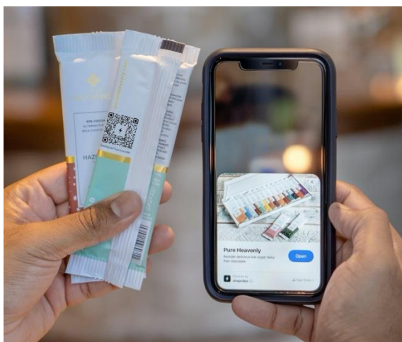
Figure 10. Example of marker based AR on product packaging

Marker-based augmented reality employs makers to activate the augmented experience, and these makers frequently feature recognizable patterns, such as QR codes or other distinctive designs, which serve as an anchor for the technology.