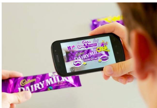
Figure 11. Example of marker less AR on packaging

Location-based augmented reality (AR) works by reading data from a camera, GPS, digital compass, and accelerometer while predicting where the user is focusing as a trigger to pair dynamic location with points of interest in order to provide relevant data or information; thus, it is enabled by the availability of smartphone features that provide location detection and AR functions by associating an enhancement with a particular location.