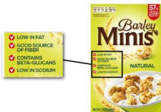
Figure 8 Example of Health claims

According to U.S Food & Drug Administration (FDA) 2018, health claims are often described as a relationship between food substances, for example, a food component or dietary ingredient and supplement, as it can reduce the risk of gaining diseases or health-related conditions.