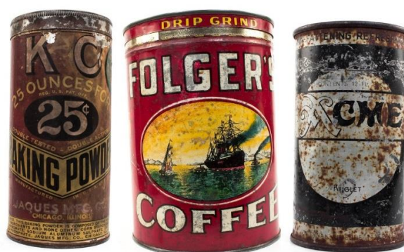
Figure 1. Collection of tin's in the year of 1800s

Metals can: It is manufactured for use in snuff, making it an excellent barrier that helps the product retain its moisture and protects its flavors by preventing the product from being exposed to elements found in the environment.