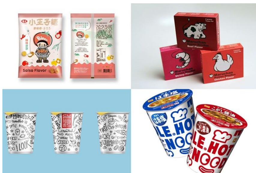
Figure 6. Example of food packaging in various size and shape

While size affects both the visibility of the package as a whole and the information displayed on it, shapes are an essential component of visual encouragement in marketing strategies and are essential features of packages (Chitturi et al., 2019).