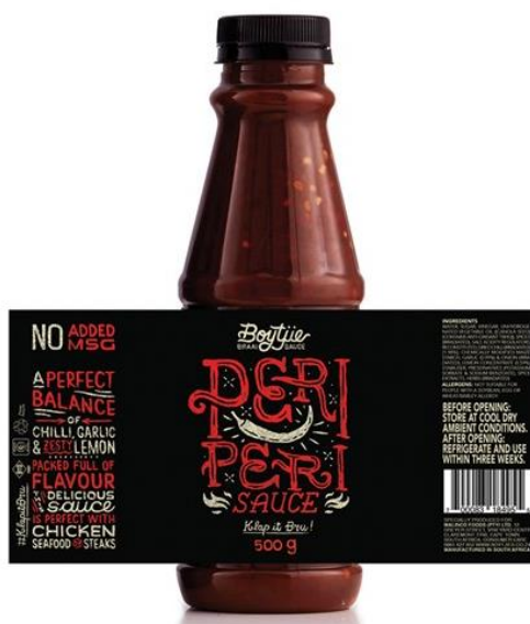
Figure 5. Example typography on the packaging of a sauce product

Typography plays a huge role in packaging design because it helps in balancing between textual and visual elements (Mukherjee, 2019). The typeface and font for product packaging are attracted significantly on product packaging. As a result, the typeface on the packaging should be associated with written information that is easier to process, and the meaning or specific information that consumers develop depends on how easy or difficult it is to read (Petit et al., 2018).