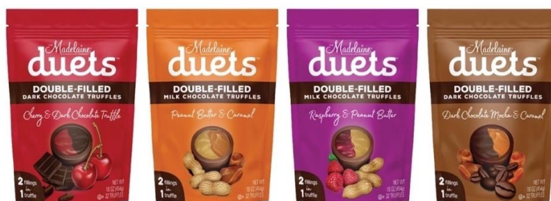
Figure 7 Example of same product packaging with different colour

Colors are used as a tool for both visual differentiation and brand recognition. It typically plays a role in every stage of a consumer's interaction with a variety of products, including from the initial search for a product in the supermarket aisle or online through its use to the discarding of any ways after use. Packaging colors can be developed to have an intuitive meaning for a specific product category, and the color of the packaging is related to the product's content (Garaus et al., 2019).