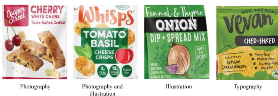
Figure 4. Sample of photo and illustration types of image

Graphic design on the packaging is used to communicate the vision, encourage merchandising, and as a strategy to contribute to the cause of purchasing behavior. Previous research has found that graphic design, such as the image on the packaging, can help build the product's brand and create its own identity by allowing the consumer to differentiate a similar product manufactured by a competitor (Yeo et al., 2020). Usually, graphics include layout, color combinations, typography, and product photography, these aid in creating an image. In terms of images, it can be divided into two types: photos and illustrations, which are generally used on the packaging of food and fashion. Moreover, the use of photos can make the food look appetizing while photos of clothes look understandable and clear while the images are created using different kinds of techniques; hence, a variety of the images on the packaging could be interpreted in a wide range based on consumer point of view (Pensasitorn, 2015). Furthermore, based on previous literature reviews and relevant research, there were four types: photos, illustrations, photos with illustrations, and typography (Pensasitorn, 2015).