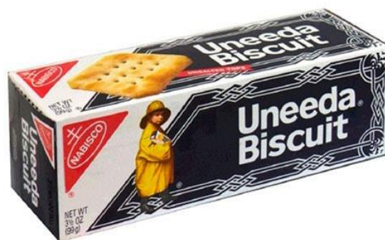
Figure 2. Uneeda Biscuits packaging

Paperboard: It was used to manufacture folding cartons during the early years of the 1800s.