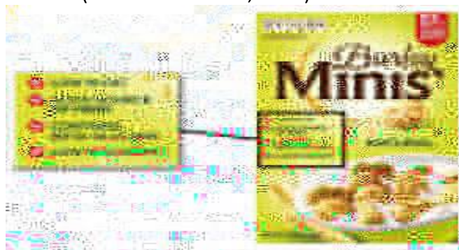
Figure 9. Example of nutrition claim

According to the Ministry of Health Malaysia (MOH), there are three types of claims permitted in Malaysia: nutrient content claims, comparative nutrient claims and nutrient function claims. For example, nutrition content claims (such as “low in fat”) or, more simply, nutrition claims describe the relative or absolute level of a nutrient in a food product (Oostenbach et al., 2019). They can be contrasted with health claims (such as “calcium helps build strong bones”) that describe the properties of a food product or food component concerning health or disease (Oostenbach et al., 2019).