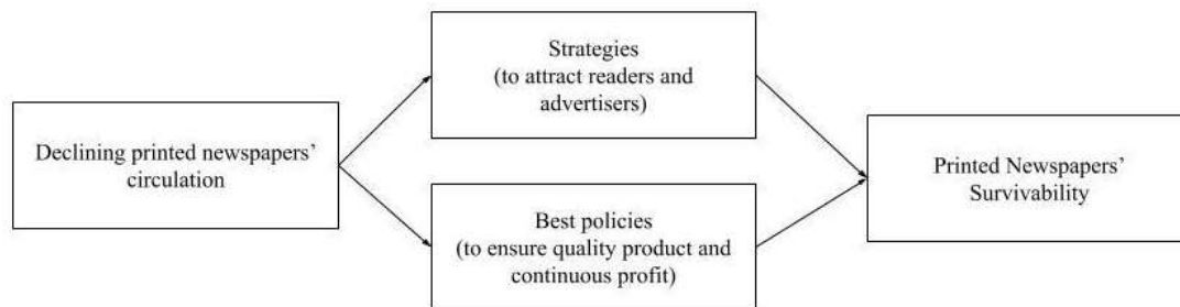
Figure 2: Conceptual Framework

circulation, the study aims at exploring and identifying strategies and best policies that would allow the platform to attract not only readers but also advertisers to ensure its survivability in the digital era. Figure 1.2 demonstrates the conceptual framework for this study.