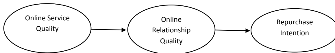
Figure 1. Research Model

The model as illustrated in Figure 1 intended to explain the consumers repurchase intentions in online private shopping sites. The key factor; online relationship quality is thought to affect repurchase intention from a private shopping site. Website service quality or online service quality is included to the model as antecedent of online relationship quality. A set of hypotheses developed based on a review of the related literature as discussed in the following section.