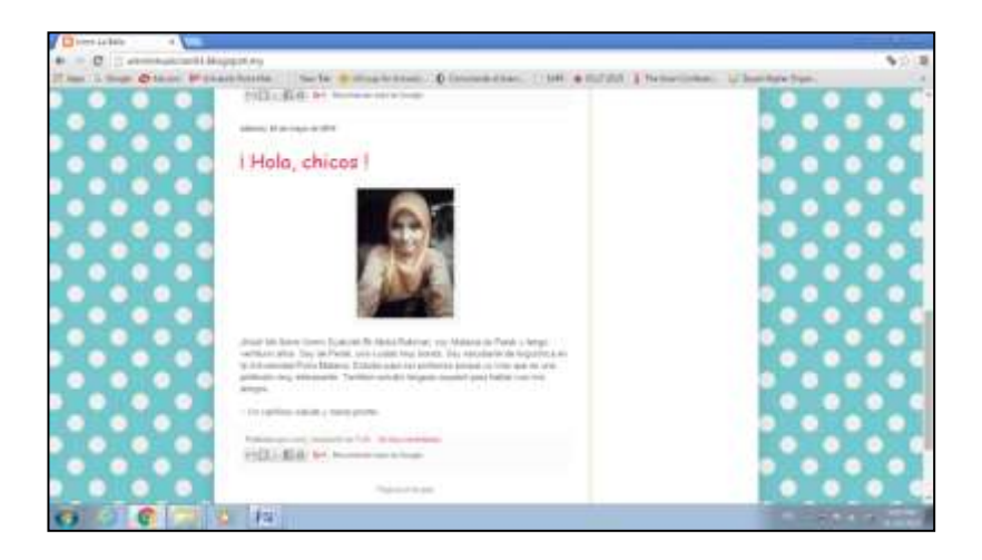
Figure 2. Hola Chicos (http://ummimusician93.blogspot.my/)

Vol. 13, No. 9, 2023, E-ISSN: 2222-6990 © 2023