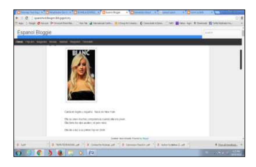
Figure 3. Mi Idolo (http://spanisheddieupm.blogspot.my/)

In the blog http://spanisheddieupm.blogspot.my/ in Figure 3, the learner also demonstrates her ability to use old information and then add a new one, by writing about something different that is "mi idolo" (my idol). Although the sentence constructed is simple, it is proof enough that there is cognitive development. At this stage, the learner is able to match old information obtained during classroom with new information found in the internet.