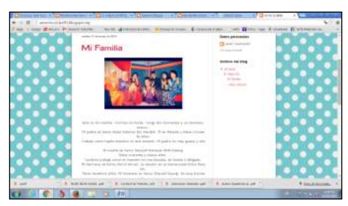
Figure 1. Mi Familia (http://ummimusician93.blogspot.my/)

Referring to http://ummimusician93.blogspot.my/ blog in Figure 1, it is clear that the learner's work fulfils the aspects of schema and assimilation of the Piaget (1952) theory. This is because the learner is able to use her newly learnt basic Spanish vocabulary and applying it to her existing knowledge about blogs. Observing the blog, it can be seen that this learner is able to produce two simple writings regarding herself and her family. The use of simple sentences like "mi padre es muy guapo y alto" (my father is very handsome), "tambien trabaja como maestro en una escuela" (Also, he works as a teacher in a school), "tiene quince años" (he is 15 years old) and others serve as evidence that there is cognitive development.