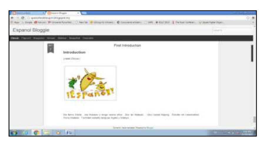
Figure 4. Español (http://spanisheddieupm.blogspot.my/)

Learners' creativity is further displayed through Spanish cultural elements seen in the images from the second participant's blog as shown in Figure 4. In one instance, the learner displays a cultural depiction of a cartoon character wearing a "sombrero", a broad-rimmed, high-crowned hat made of felt or straw worn especially in Spain and Mexico. The learner is able to expand the learning of Spanish vocabulary to learning the culture of the language. This is in line with Hauck's (2007) finding that suggested learners obtained cultural knowledge from the language learnt.