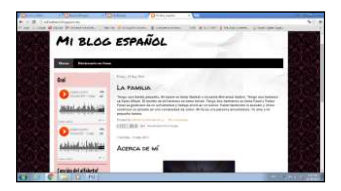
Figure 5. Mi Blog Español (http://adibahms.blogspot.my/)

Generally, the writings in the http://adibahms.blogspot.my/ blog in Figure 5 deal with the self and the family. This is because at the basic learning level the learner needs to have something that is already known or familiar to the learner's immediate surrounding to serve as a basis for the constructive process to take place. Sentences like "tengo una familia" (I have a family), "soy estudiante" (I am a student), "estudio para ser profesora" (I am learning to be a lecturer) and others show that the learner's proficiency is at the basic level. However, because there is accommodation, previous knowledge of sentence structure is used to create new sentences. This shows that a constructive learning process has occurred. The blog starts with a simple introduction to "Mi familia" (My family). Although there is some spelling mistake, the learner is able to write a sentence about family. However, in this learners' accuracy is not focused therefore mistakes are not discussed. Spellings are not ignored because the main focus are on learner's ability to use old information and create new ones.