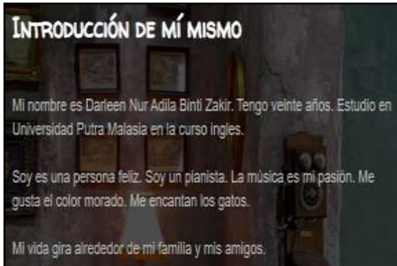
Figure 9. La Familia y Introducción De Mi Mismo (http://darleengoesspanish.blogspot.my/) The sentences in Figure 9 are: