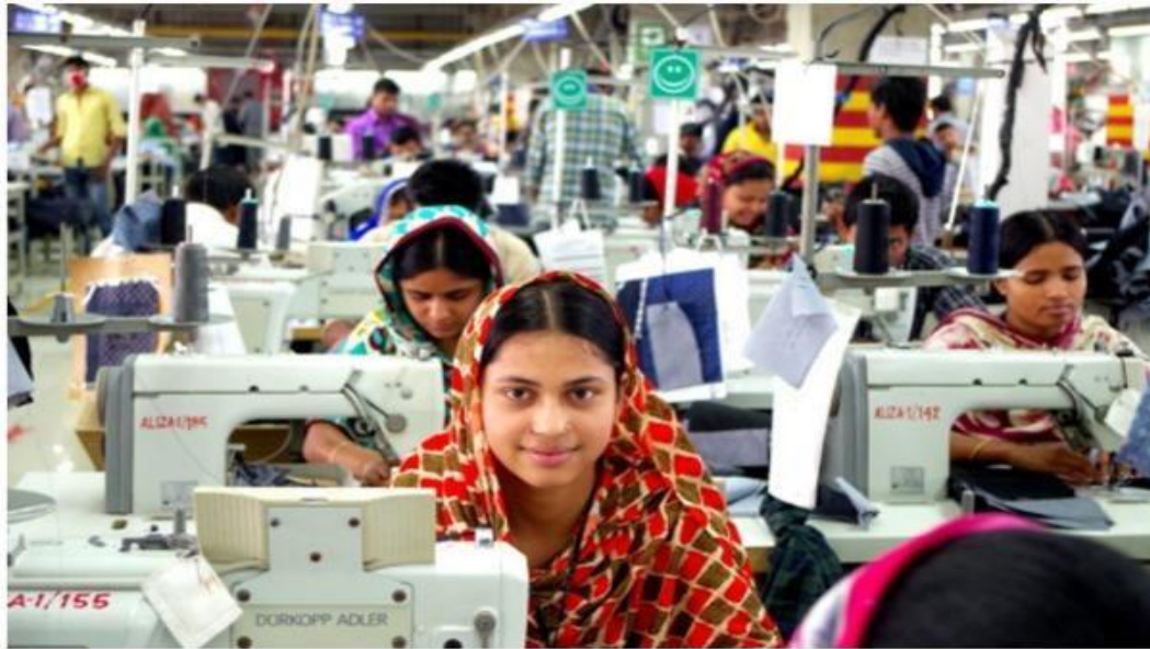
Figure 3. Female workers working environment in a garment industry in Bangladesh.