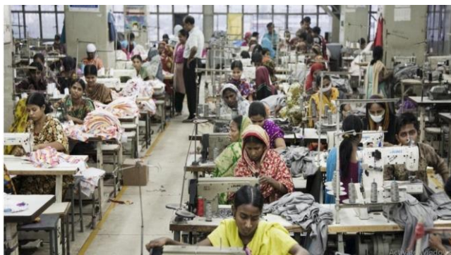
Figure 4. Working conditions in garment Factories Bangladesh 2

Islam and Muquim (2015) said that, over the years, numerous garment workers lost their lives due to repeated fires caused by non-compliance with fire safety regulations (Islam & Muquim, 2015). A study in 2017 opined that female workers struggle to earn their livelihood during pregnancy (Akhter et al., 2017). Another study in 2018 found that public health, human rights issues, and domestic violence affect billions of people. According to this report, financial empowerment is not strong enough to protect workers from domestic violence (Naved et al., 2018). Wadud et al. (2014) found that most garment workers come from untrained rural areas. However, Bangladesh's female garment workers play a significant role in the country's economic development (see Table 1) (Wadud et al., 2014).