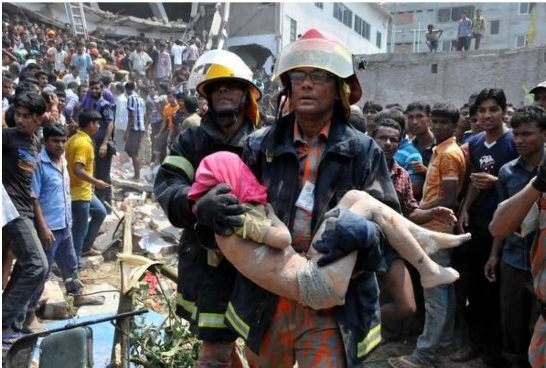
Figure 2. Rana Plaza building incident, Savar & Bangladesh, 2014.