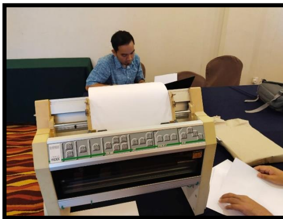
Pic 2: Module in printing process

In total, this module has 60 pages printed in braille on both sides of the page. The front page is decorated with the logo and name of the publisher, funder and also the project lead institution. The content of this module includes explanations related to two types of zakat, namely Zakat Fitrah and Zakat Harta. The explanation covers each sub-category for both types of zakat, the evidence, the basis for paying zakat, how to calculate and the wisdom of giving zakat (Rejab et al., 2023). This module is also supplied with tables related to the type and method of calculation. This simplified content does not affect the requirements and important contents related to zakat. Produced in the size of braille paper, makes it easy for blind people to access and also carry it by holding it with one hand or placing it in a bag. In order to meet ethical values, the front page of this module is printed with tactile logos and background images related to zakat and blind people.