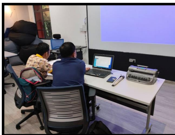
Pic 1: Panels discuss for the best structures module for the blind

The Braille Module of Zakat Management Education for the Blind is produced based on the existing zakat management education module that is updated to suit the abilities of the blind. This module is written in braille format. This production is innovative by improving the content, sentence structure and delivery method. Since braille writing requires a large space to write each word cell, the number of pages will increase compared to a normal module. The production of this module involves three braille writers consisting of braille writing experts and teachers of visually impaired options. In addition, in order to maintain the quality and standard of braille writing, the Malaysian Blind Foundation (YOBM) was also invited as a quality advisor for the production of this module.