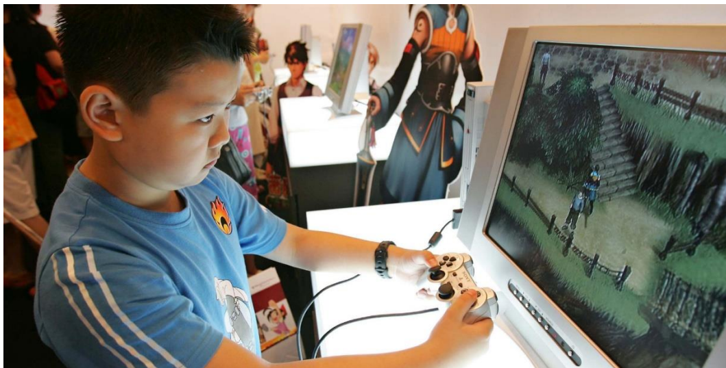
Figure 2. A Chinese kid playing games.

Furthermore, a key factor for any company in China is its e-reputation (Goyal et al., 2022; Muravevskaia & Gardner-McCune, 2023). One needs to understand and know Chinese consumers to gain an advantage in the increasingly prevailing VR market. As the VR industry is rapidly flourishing in China and children are also prominently getting addicted to VR games, investigating virtual reality design interface in children regarding their enthusiasm for VR gaming is an interesting and contemporary research topic, particularly in China (Cruz-Neira et al., 2018).