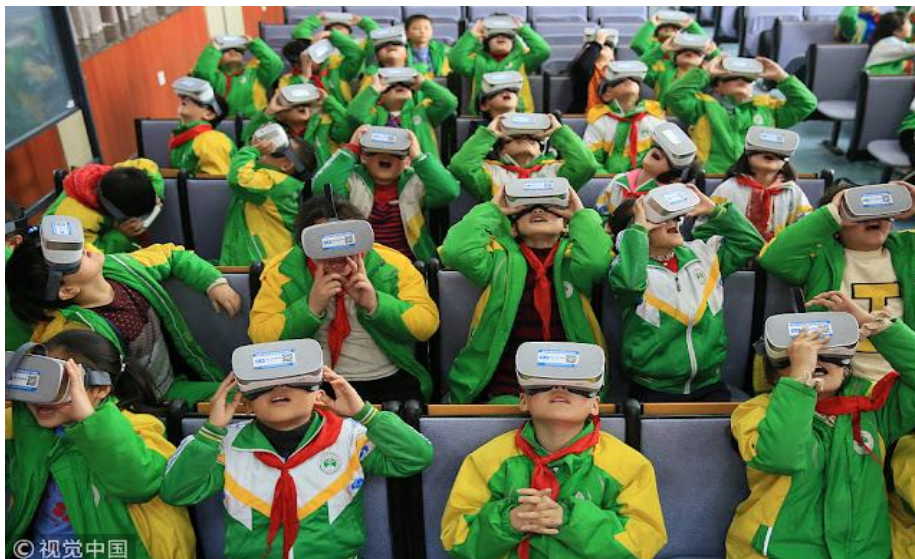
Figure 1. Students learning science via VR devices in Hunan Province, China Source: (Alhadeff, 2018).

Taking into the context of children's consumerism, VR toys and gaming have grasped numerous children's attention as Chinese kids increasingly become addicted to these games. Parents are more supportive of their children when playing VR games because of the numerous benefits of such games for children (Kaimara et al., 2022). Many Chinese companies specializing in VR include Alibaba, Baidu, Ten Cent, Huawei, Meitupic, HTC, IQIYO, etc. In China, children are provided with many options for VR games, the most famous of which include Xbox games (Figure 2), VR theme parks by Movie Power, and others (Artashyan, 2023). As virtual reality design interface in different products has made their way into numerous giant technology companies and development platforms, it can likely be the most effective way to develop a business as almost everybody is addicted to smartphones. Children even find VR gaming even more fascinating. Therefore, certain factors are considered while designing a VR interface for children. Such user-interface must be simple and easy to understand. Moreover, in the children's VR products, the content should be age-appropriate