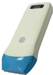
Figure 2: Linear Series UProbe-L5 ultrasound machine (Cornwall, UK)