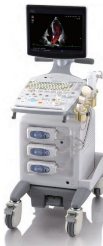
Figure 3: Hitachi Aloka F37 ultrasound machine (Tokyo, Japan)