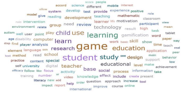
Fig. 3. Word frequencies based on 35 articles

Based on the word cloud in Figure 3, the current study from 2014 to 2023 focuses more on the term "game" (3278 times), "student" (2494 times) and "learning" (1917 times). Other words that were frequently captured were "education", "child", "use", "learn", "research", "study", "education", "teacher", "technology" and "gamification".