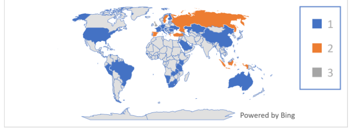
Fig. 2. Paper breakdown according to the country of publication

This part answer RQ1: "What are the current trends in digital gamified learning that could be found in the literature from 2014 to 2023?" There is a wide range of countries that have done research on gamified learning. Most papers were published in the United Kingdom (3 articles), followed by Cyprus, Greece, Indonesia, Russia, Spain, Sweden and Turkey (2 articles). Besides Indonesia and Philippines, other ASEAN countries have less research on digital gamified learning. Figure 2 shows the number of papers published in index journals: