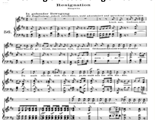
Excerpt 3. The meaning of descending thirds in Beethoven’s Resignation WoO 149

Next, in the upper register sounds another musical actor, musical actor b , as a reminiscence of or ‘answer’ to musical actor c , though condensed into a relatively brief reply. Musical actor b leads the narration back to G3 (the register of the opening) in m.13 (Tarasti, 1991, p.114).