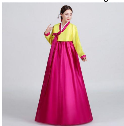
Figure 1: Chinese Korean Traditional Clothing

During significant Korean festivals, a portion of attendees chooses to wear Korean traditional costumes, adding vibrant colors to the festival atmosphere. However, it's notable that not everyone opts for traditional clothing, particularly among the younger demographic. Many prefer modern, convenient, and creatively designed attire over the fixed and relatively unchanged colors and styles of traditional Korean clothing.