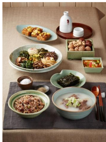
Figure 2: Jeongwol Daeboreum-sang

The celebration of the first full moon, which falls on the 15th day of the lunar calendar, is the biggest holiday along with the eighth full moon, Chusoek. During the celebration, people wish for good health and fortune in the upcoming year by playing traditional games and sharing meals (Fig. 2). In the morning of Jeongwol Daeboreum, people make okokbap with five grains (glutinous rice, red beans, beans, sorghum, millet) and dried namul (bracken, mushroom, eggplant, squash, cucumber, dried radish greens, aster), which is preserved from the past year to be consumed in the winter. These dried namul are first soaked in water, blanched, then seasoned or stir-fried.(Kwon.et al.,2014)