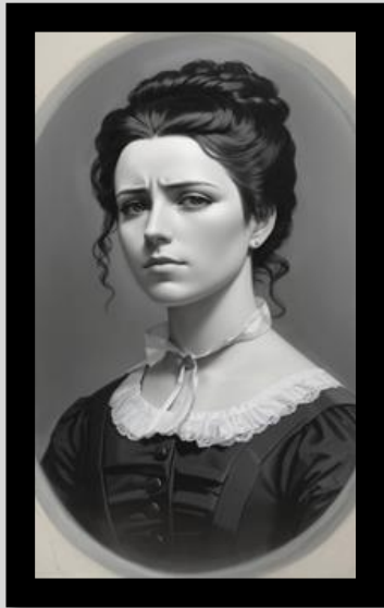
An AI art generation by 737990

Prompt: Generate a sombre image showing Elizabeth Barton in a moment of vulnerability, reflecting on her downfall and the events that led to her execution.