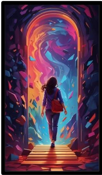
An AI art generated by UU

Prompt: Design an image showing a person stepping out of a comfort zone represented as a tombstone. Show vibrant dreams and opportunities outside, symbolizing the courage to break free from comfort for a fulfilling life.