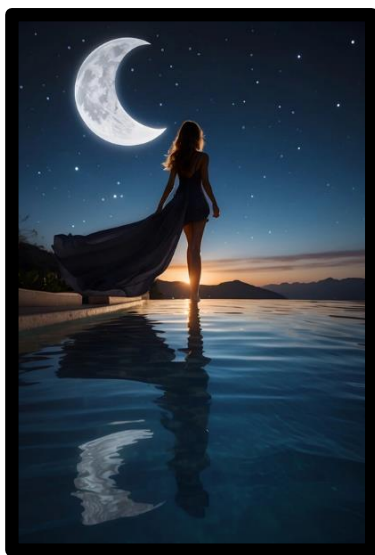
An AI art generated by alex1shved

Prompt: A silhouette of a girl stands at the edge of a pool, her hair blowing in the wind. The moon reflects off the water, creating a thousand sparkling diamonds. She closes her eyes and takes a deep breath, feeling the coolness of the water on her skin. She opens her eyes and smiles, knowing that this moment is perfect. She takes a step into the pool, and the water closes over her head. She swims for a while, enjoying the feeling of the water on her skin and the freedom of movement. Eventually, she stops swimming and floats on her back, looking up at the stars. She feels a sense of peace and tranquillity. She knows that this moment will stay with her forever. hyperrealism, skin very elaborated.