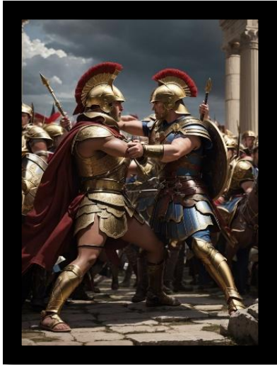
An AI art generation by Grazy_x23

Prompt : Powerful Characters: Highlight Achilles and Hector at the height of their strength, with determined and imposing expressions. Epic Scenario: Setting in the city of Troy during the war, with imposing walls and traces of conflict in the background. Intense Confrontation: Capture the crucial moment of the clash, with Achilles brandishing his famous spear and Hector defending himself with exceptional skill. Notable Expressions: Facial details that convey the intensity of the fight, showing the ferocity of Achilles and the courage of Hector. Dramatic Color Palette: Use vibrant shades of red, gold and blue to highlight the drama of the scene, adding depth and emotion. Realistic Armor Details: Highlight the details of the armor, reflecting the craftsmanship of the time, with a metallic shine in the most impacted areas. Narrative Elements: Integrate elements of myth, such as divine symbols or references to the Trojan prophecy, to enrich the story in the image.