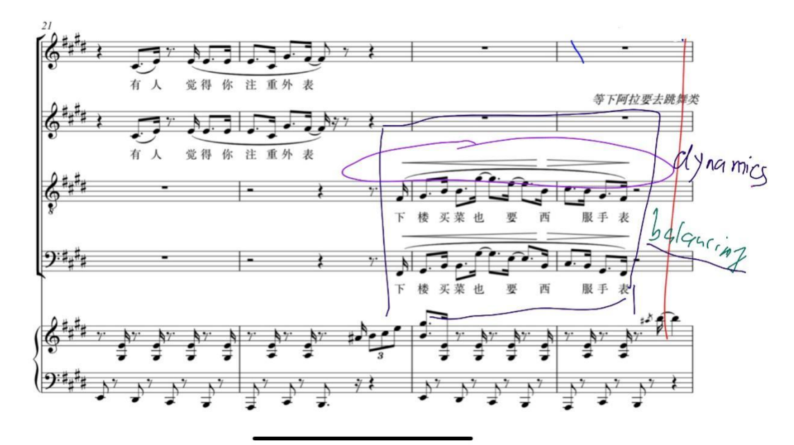
Figure 4.16 The swing style piano accompaniment of 'Magic City.

Vol. 13, No. 12, 2023, E-ISSN: 2222-6990 © 2023