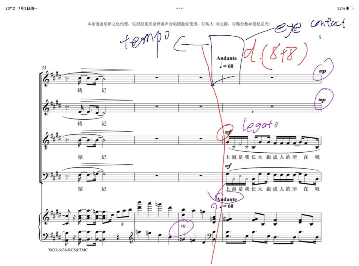
Figure 4.13 The tempo alteration of Magic City on bar 36

Vol. 13, No. 12, 2023, E-ISSN: 2222-6990 © 2023