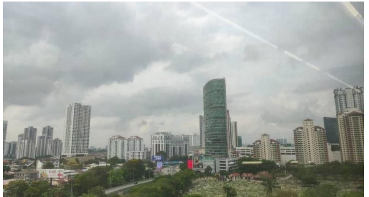
Figure 1.2(b): Around Bandar Utama MRT