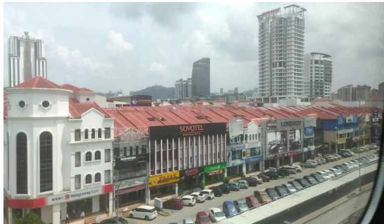
Figure 1.4: Around Surian MRT