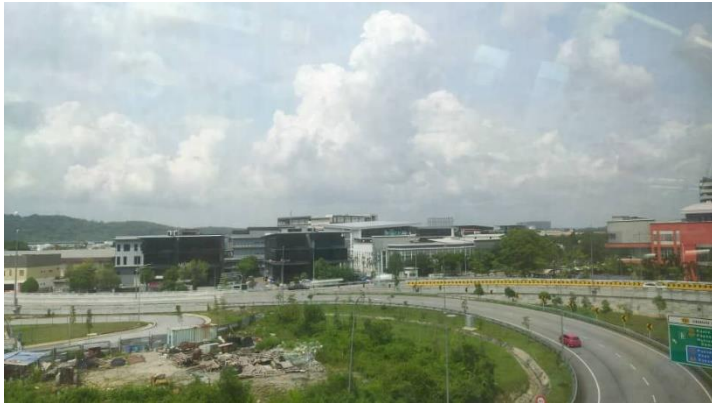
Figure 1.3(a): Around Kwasa Sentral MRT