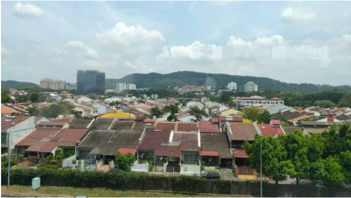
Figure 1.2(a): Around Bandar Utama MRT

population in that area was 176131 in 2010 (BANCI, 2010). In 2020, the population increased to 196213 (BANCI 2020). The Bandar Utama MRT station catalyzes population growth, economic development, and the fostering of a vibrant community in its vicinity. So, residents and visitors can enjoy outdoor leisure activities at parks and green spaces nearby.