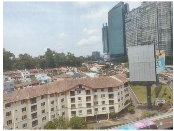
Figure 1.1(a): Around Phileo Damansara MRT Figure 1.1(b): Around Phileo Damansara MRT

The Bandar Utama MRT station plays a pivotal role as a central transportation hub in the Kuala Lumpur MRT network, situated within the dynamic township of Bandar Utama (MRT Crop, 2024). Acting as a vital connection point for residents and commuters, the station facilitates smooth and efficient travel and connectivity. Located in Bandar Utama, the MRT station offers convenient access to a wide range of amenities and attractions, thereby enhancing the development and attractiveness of the surrounding area. Primarily, the presence of the Bandar Utama MRT station has led to a rise in the local population. Figure 1.2 (a) shows many individuals and families are drawn to reside near the station due to its accessibility and connectivity to various parts of the city, resulting in the growth of residential properties and communities nearby (New Straits Times, 2017). Furthermore, the station has sparked commercial and economic growth in the vicinity. Bandar Utama is renowned for its integrated township concept, featuring shopping malls, office buildings, and recreational facilities as shown in Figure 1.2 (b). Additionally, the Bandar Utama area offers diverse attractions and recreational facilities that complement the MRT station. The presence of the 1 Utama Shopping Centre, one of Malaysia's largest malls, along with other retail complexes, dining outlets, and entertainment venues, enhances the appeal of the area, because of that the