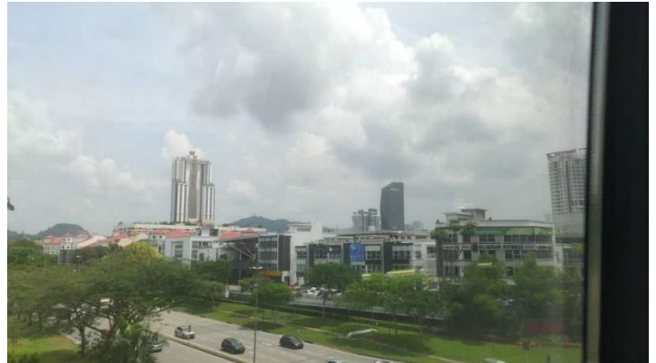
Figure 1.3(b): Around Kwasa Sentral MRT