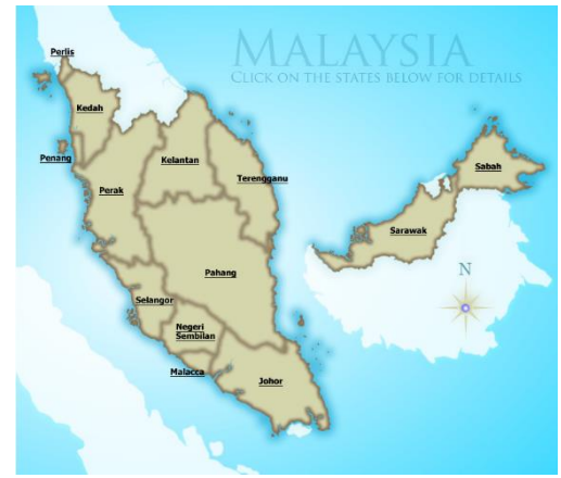
Figure 1: Malaysia Map

Malaysia is a tropical nation with a landmass of 329,847 km2 that is located in Southeast Asia's center region. It is situated between the latitudes defined by the Equator and 7' north and the longitudes 100 and 120 east (Jalil et al., 2022). The South China Sea divides the nation's two regions, West Malaysia and East Malaysia. The Peninsular, which consists of 11 states, is West Malaysia. On the island of Borneo, there are two states called Sabah and Sarawak that make up East Malaysia (Chin, 2020; Lai et al., 2022). Kuala Lumpur is the federal government's headquarters, while Putrajaya is the capital city. A few nations encircle Malaysia. Thailand borders Malaysia to the north, Singapore and Indonesia to the south, and the Philippines Islands to the east. Figure 1 below shows the map of Malaysia.