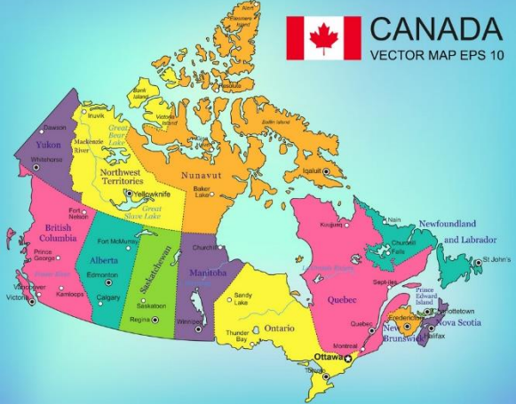
Figure 2: Canadian Map

Canada has ten provinces, three territories, and 13 subnational divisions. Local government is governed differently in each region. Long ago, colonial North America included the area that is now Canada (Ray et al., 2021). Midway through the 19th century, the region gained independence while maintaining ties to the British throne (Eidsvik, 2016). The British North America Act, often known as the Constitution Act of 1867, was passed on July 1, 1867, establishing Canada and its first four provinces, Ontario, Québec, New Brunswick, and Nova Scotia (Smith, 2018). Canada has diverse natural scenery as a country with several distinct geographical regions. The Canadian Shield's most significant physical area is Hudson Bay, covering half of the nation (Li Yung Lung, 2018). Lowlands predominate in Canada's southeast, surrounded by the Great Lakes (Lake et al.) (Olson et al., 2020). In 2020, there will be 38 million people living in Canada, which is only 10% as many as in the United States (Urrutia et al., 2021). The largest city in Canada is Toronto, and Ottawa is the national capital. English and French are the spoken languages (Ray et al., 2020). Figure 2 below the map of Canada.