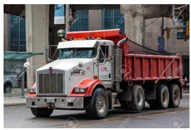
Figure 4: The new type of dumping collector lorry